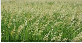
Invasive brome before treatment

Background: Bromus Inermis , a perennial, cool-season grass, was introduced in 1884 for erosion control and for use as a forage crop. It currently thrives throughout the U.S. Grasslands, savannas, and meadows are susceptible to invasion due to brome's preference of moist and sunny locations.