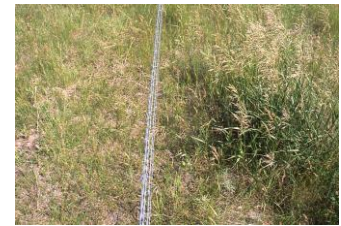
Invasive brome before (right) and after (left) treatment/eradication