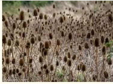
Teasel monoculture after seed dispersal

3. Foliar spray- This involves spraying the leaves with a solution of properly labeled herbicide plus a non-ionic surfactant, which improves the chemicals ability to adhere and absorb into the plant. This method should be used during the active growing season so care should be taken to avoid spraying non-target species.