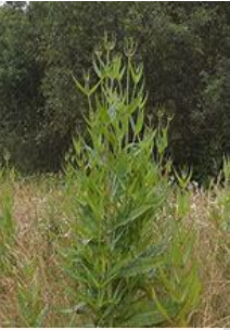
Teasel bolt in early summer

Teasel is biennial plant that was introduced in the 1800s for textile processing. It is native to Eurasia and North Africa. It is a noxious weed and forms large monocultures in disturbed and unmanaged areas. Often resembles thistles.