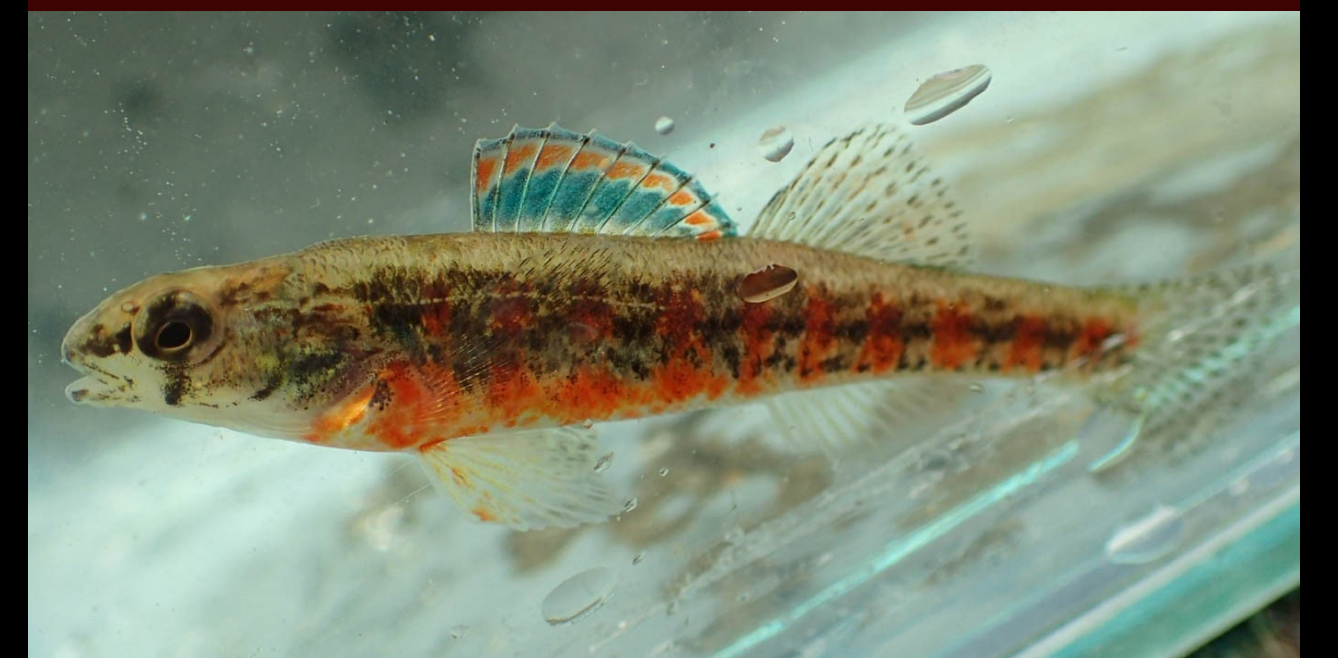
Lake Michigan & Coastal Area Campaign