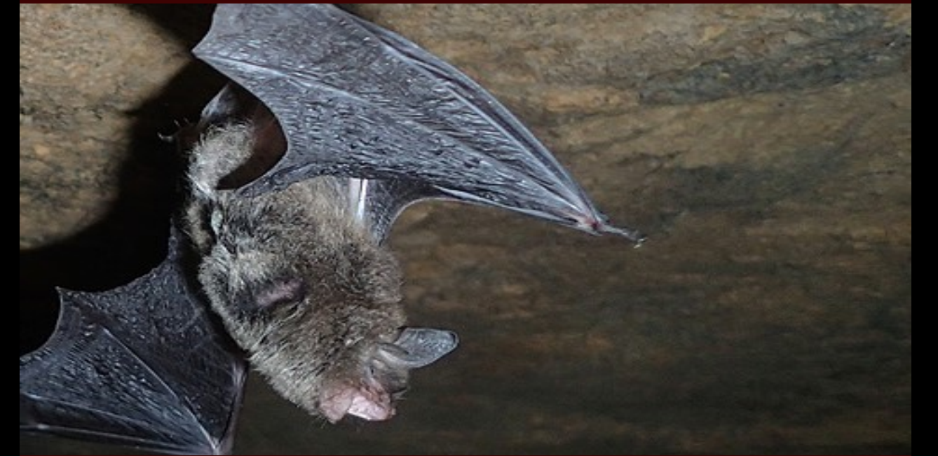
Forest & Woodland Campaign