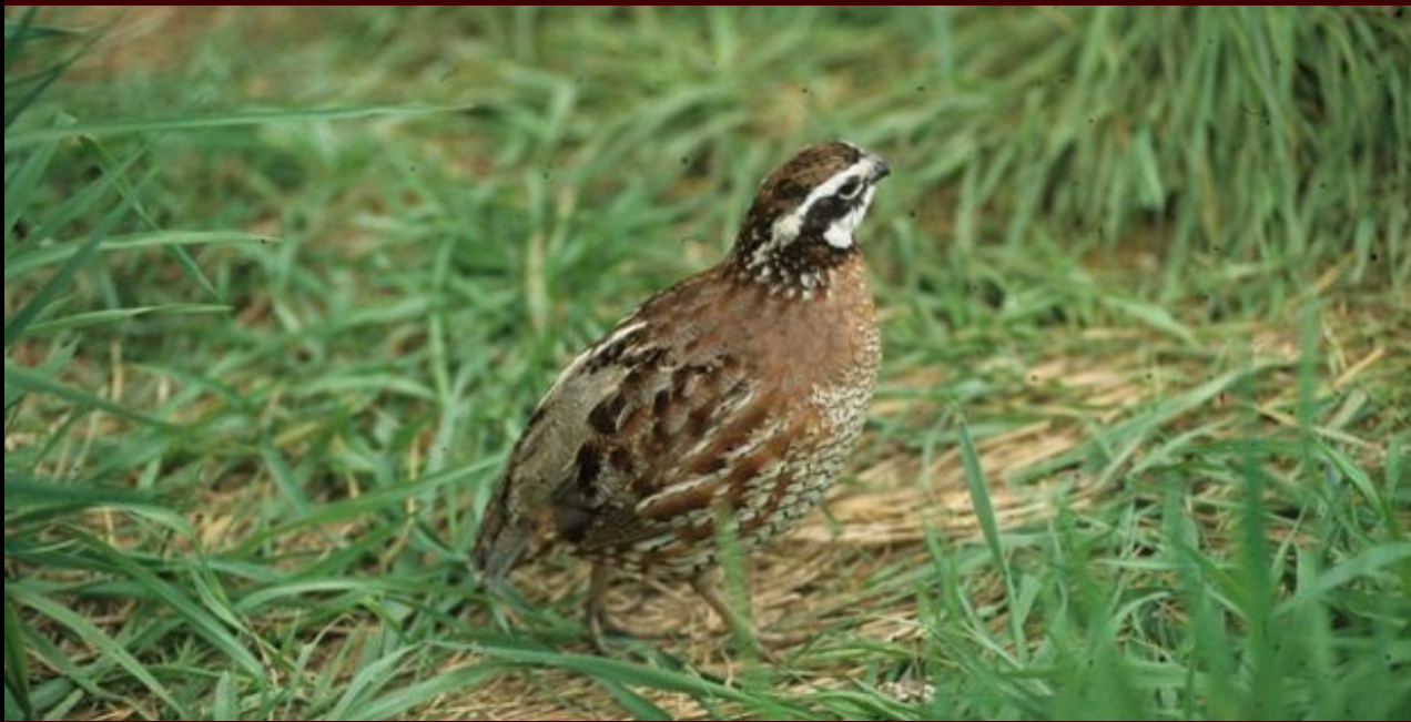
Farmland & Prairie Campaign