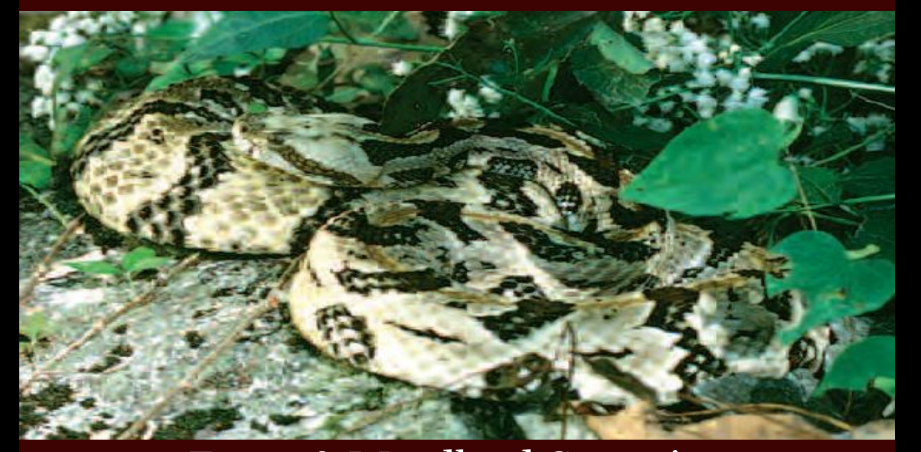
Forest & Woodland Campaign

S pecies in Greatest Conservation Need (SGCN) are wildlife species that have been identified as being vulnerable to specific threats, having rare or declining habitat, or possessing certain characteristics that make them vulnerable.