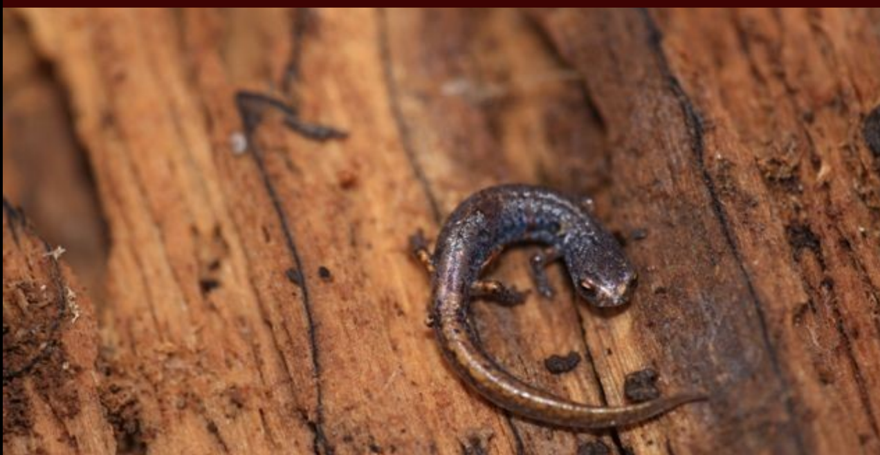
Forest & Woodland Campaign