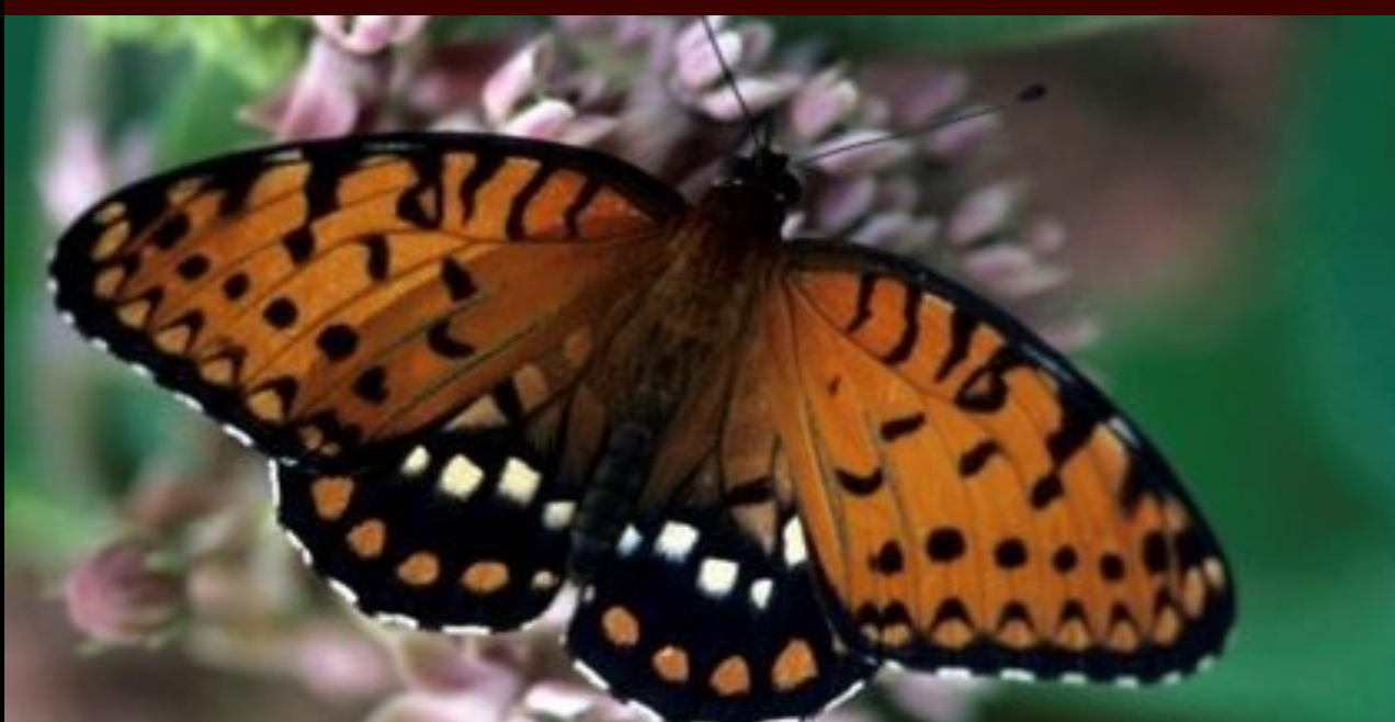
Farmland & Prairie Campaign