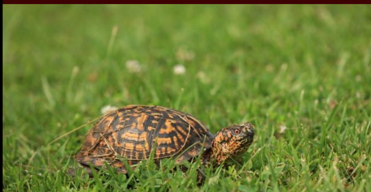
Forest & Woodland Campaign