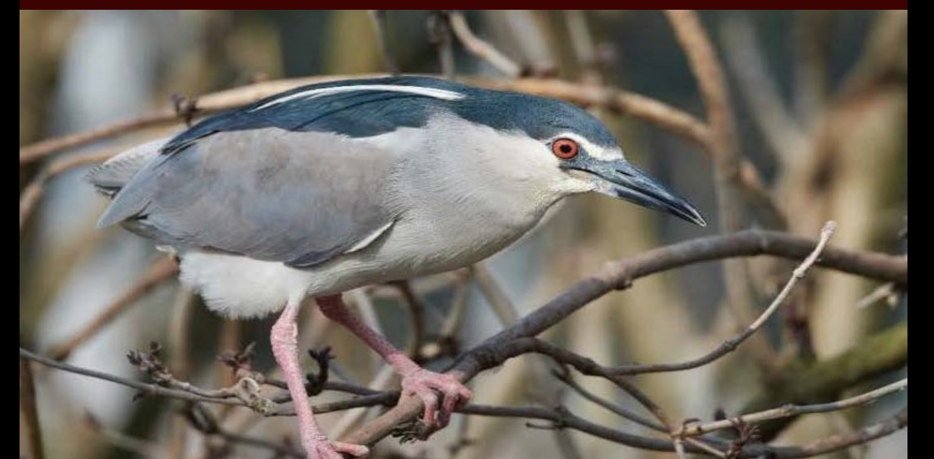
Green Cities Campaign