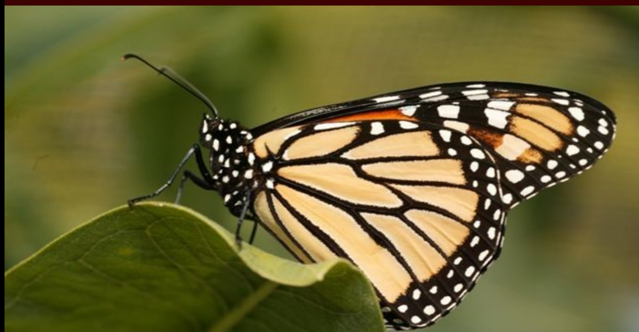
Farmland & Prairie Campaign