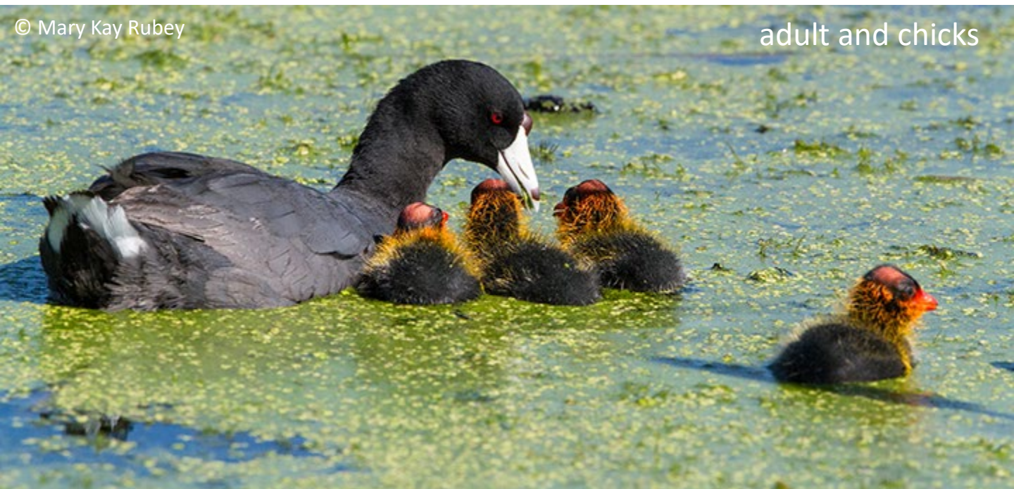
adult and chicks