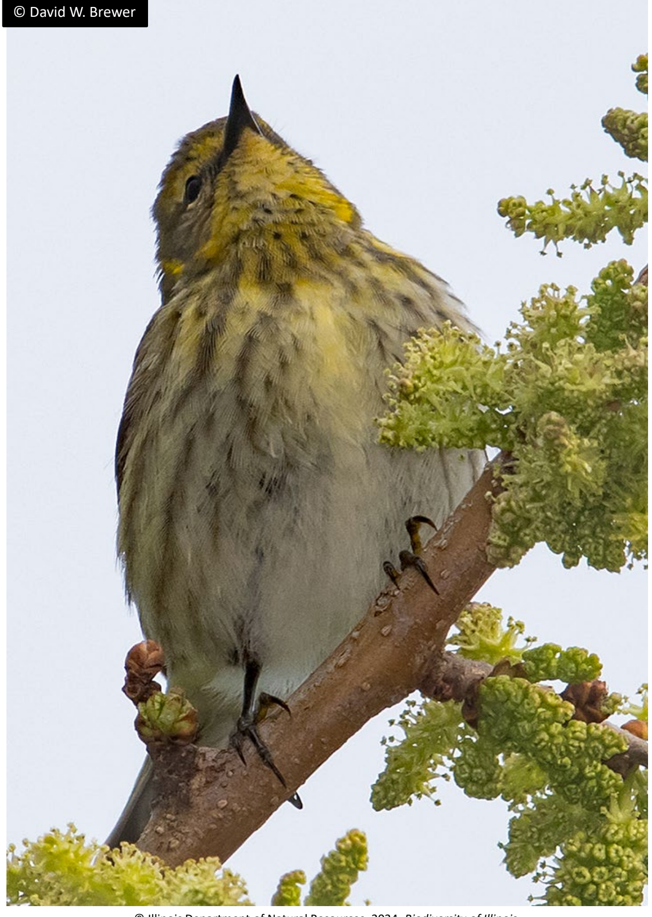
© Illinois Department of Natural Resources. 2024. Biodiversity of Illinois .