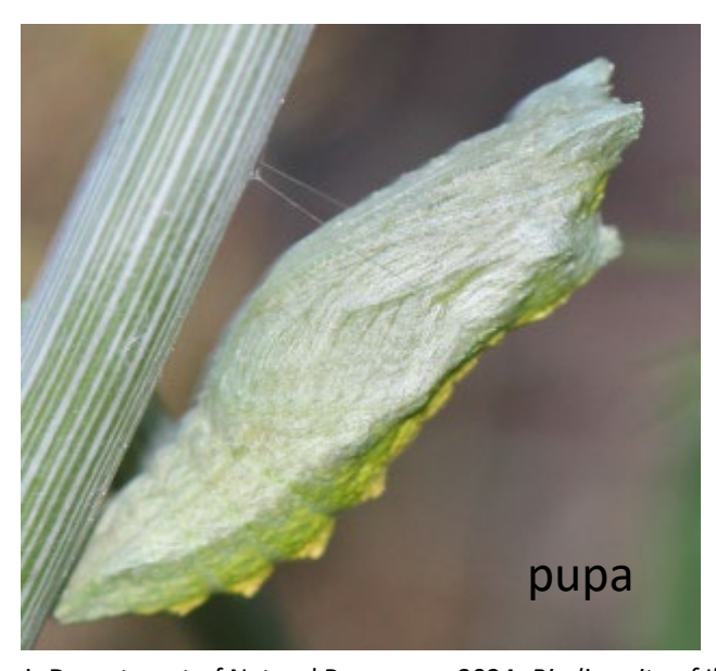
© Illinois Department of Natural Resources. 2024. Biodiversity of Illinois .