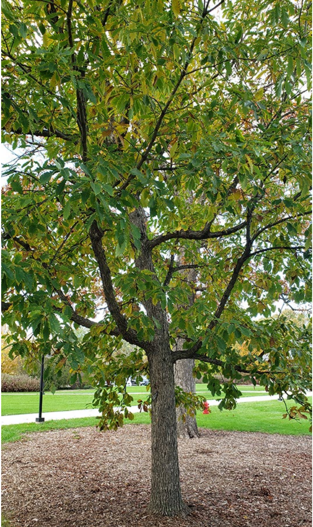
© Illinois Department of Natural Resources. 2024. Biodiversity of Illinois .