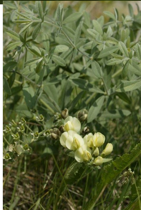
leaves and flowers