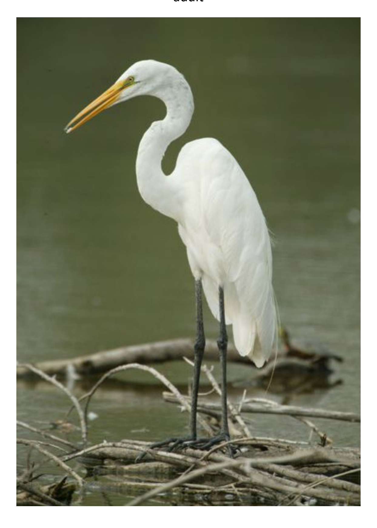
© Illinois Department of Natural Resources. 2024. Biodiversity of Illinois .