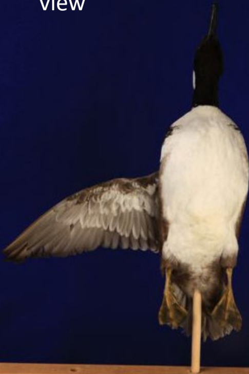
male ventral view