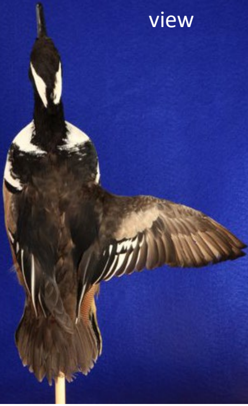
male dorsal view