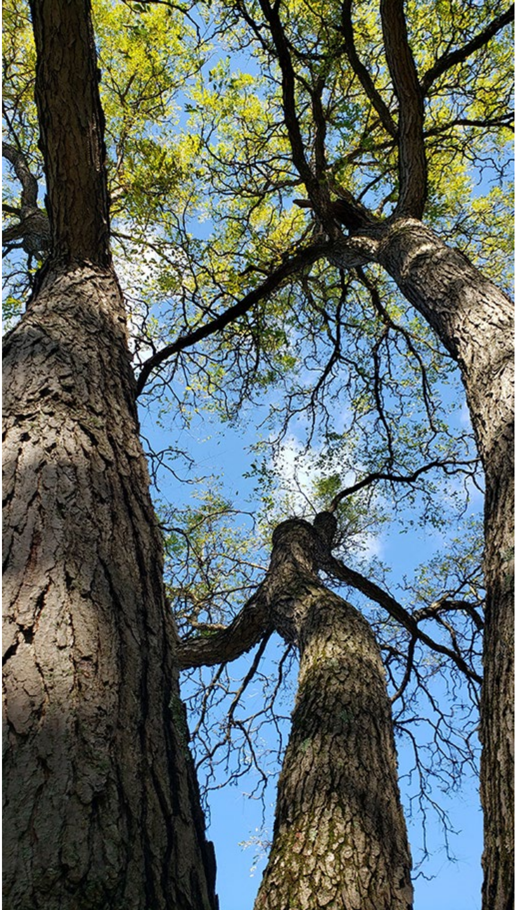
© Illinois Department of Natural Resources. 2024. Biodiversity of Illinois . Unless otherwise noted, photos and images © Illinois Department of Natural Resources.