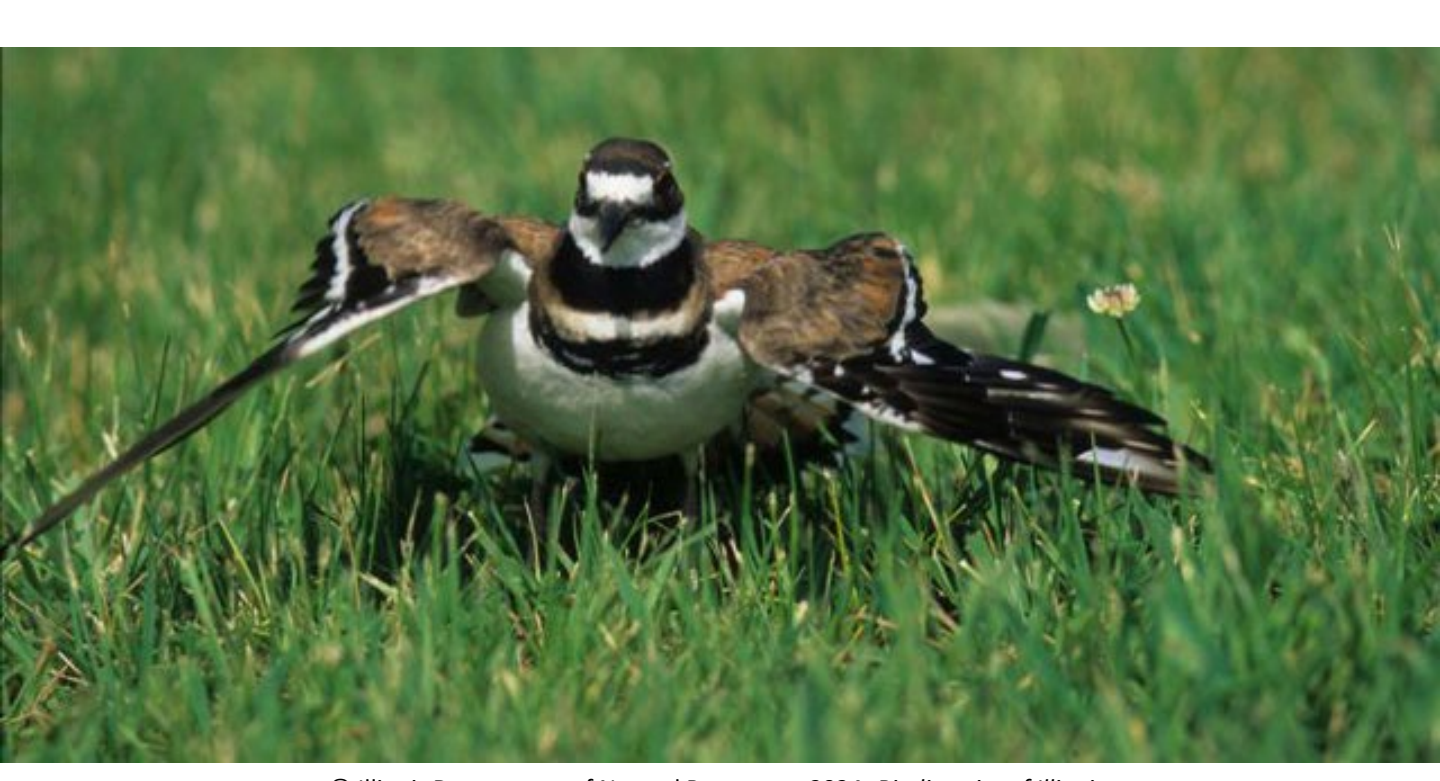
© Illinois Department of Natural Resources. 2024. Biodiversity of Illinois .