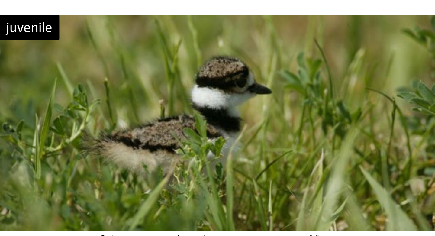
© Illinois Department of Natural Resources. 2024. Biodiversity of Illinois . Unless otherwise noted, photos and images © Illinois Department of Natural Resources.