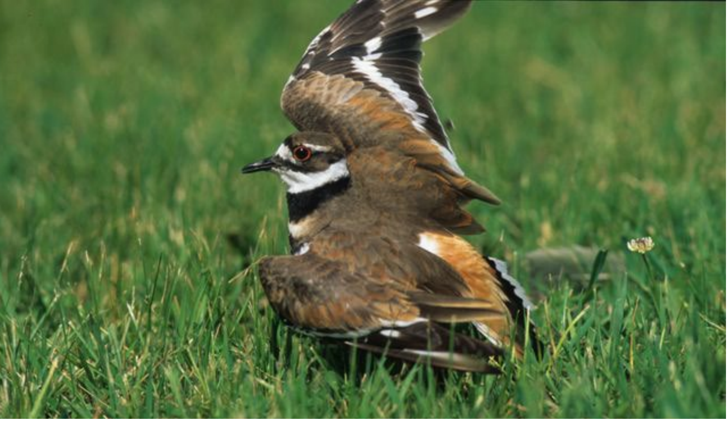
displaying broken-wing trick