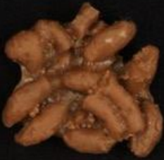
scat and tracks