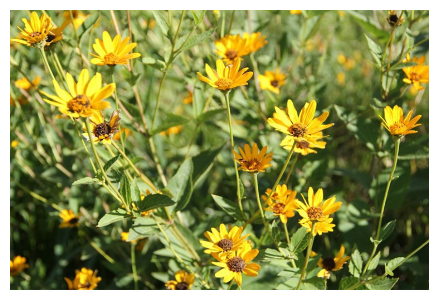
plant with flowers