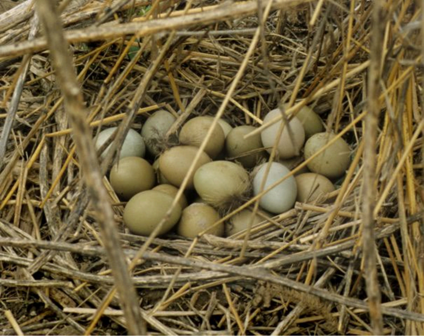
eggs in nest