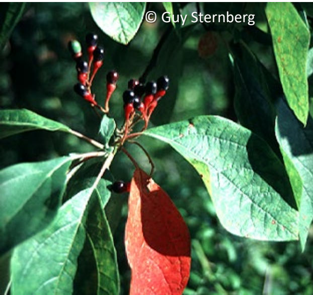
ripe fruit and leaves