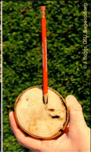
Signs and symptoms of Asian longhorned beetle (ALB). Clockwise from top left: adult ALB and exit hole. Severely infested tree. Perfect round exit holes. Pencil inserted far into trunk checks depth of gallery (because larvae tunnel deep into the wood). Egg sites and exit hole.