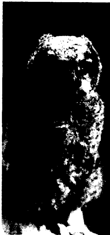
Young Gt. Horned Owl