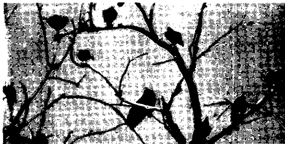
Turkey Vultures at roost site (M. Campbell)

TURKEY VULTURE: C, early SM, SR (PN), late FM; easily found soaring along the bluffs of the Middlefork River and over fields in the valley.