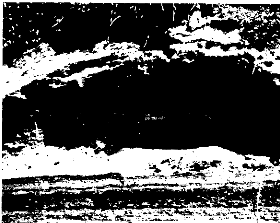
Colony of swallow nests (S. Bailey)

BARN SWALLOW: C, SR (N); usually found hunting over ponds or low over fields. Commonly nests on buildings or other structures in the parks, or under bridges.