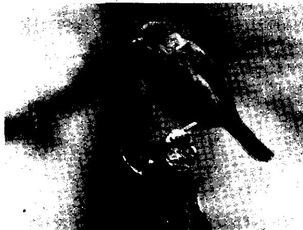
Eastern Bluebird (M. Campbell)

BROWN THRASHER: A, SR (N); easily found along fencerows and in scrubby areas. Prefers multiflora rose for nesting sites.