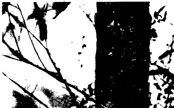
Prothonotary Warbler at nest hole (S. Bailey)

PROTHONOTARY WARBLER: U, SR (N); prefers standing water with dead snags. Two or three pairs nest each year along the river east of Pond 6 at Kickapoo S.R.A., in the Sportsman's Lake area there, and in the backwaters of Lake Mingo at Kennekuk C.P.