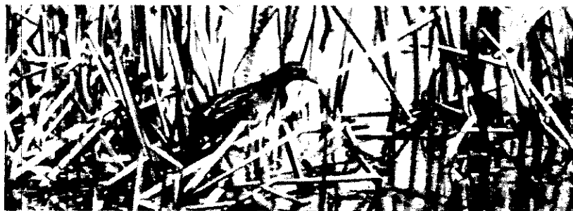
Sora rail at Kennekuk Marsh

SORA: C, SM, FM, occasional summer resident (PN); more common in spring than fall. Look in same areas as for other rails.