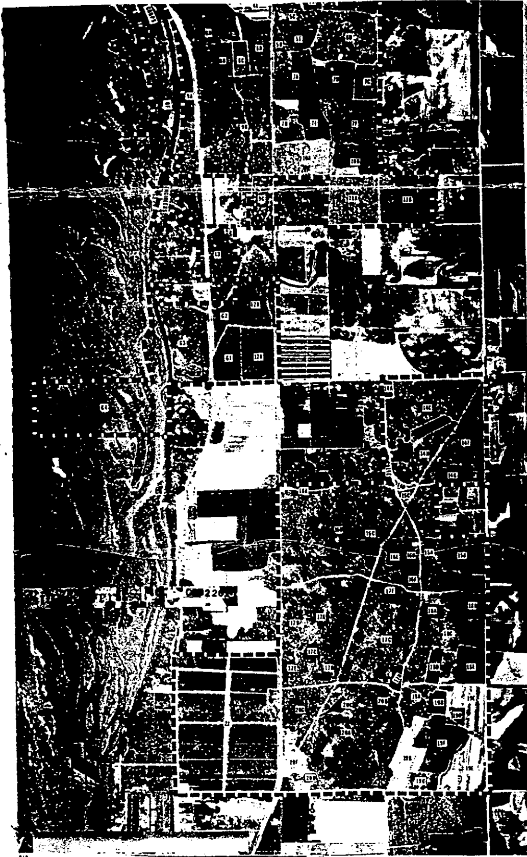
Figure. 2. Aerial view of the southern portion Big River State Forest. Southern sand prairie is in sections 20D and 20F along southern boundary. Dashed lines indicate State Forest boundaries.