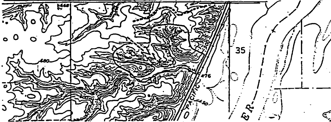
Figure 3a. Hopewell Estates Hill Prairies Natural Area outlined on the USGS 7.5-minute series map. The location of the proposed preserve Hopewell Hill Prairies is marked by an asterisk (*).