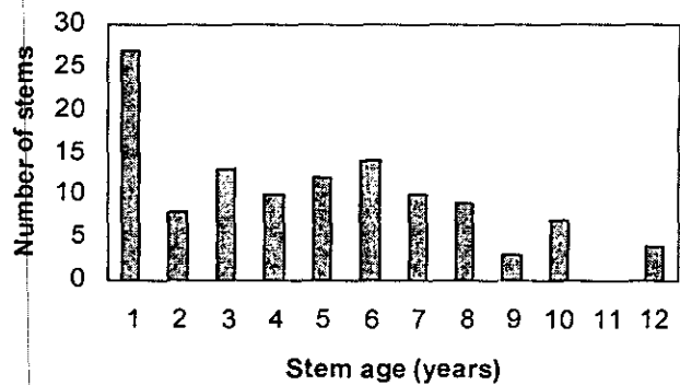
Fig. 2. Age structure of Lonicera maackii stems within the removal plots at DHNC.

The population structure at DHNC suggests a population that has only recently become established and is still increasing. Future increases in density will likely result in greater impacts on understory species composition and forest regeneration (Trisel and Gorchoff 1993; Hutchinson and Vankat 1997; Gould and Gorchoff 2000). The fecundity of this population is