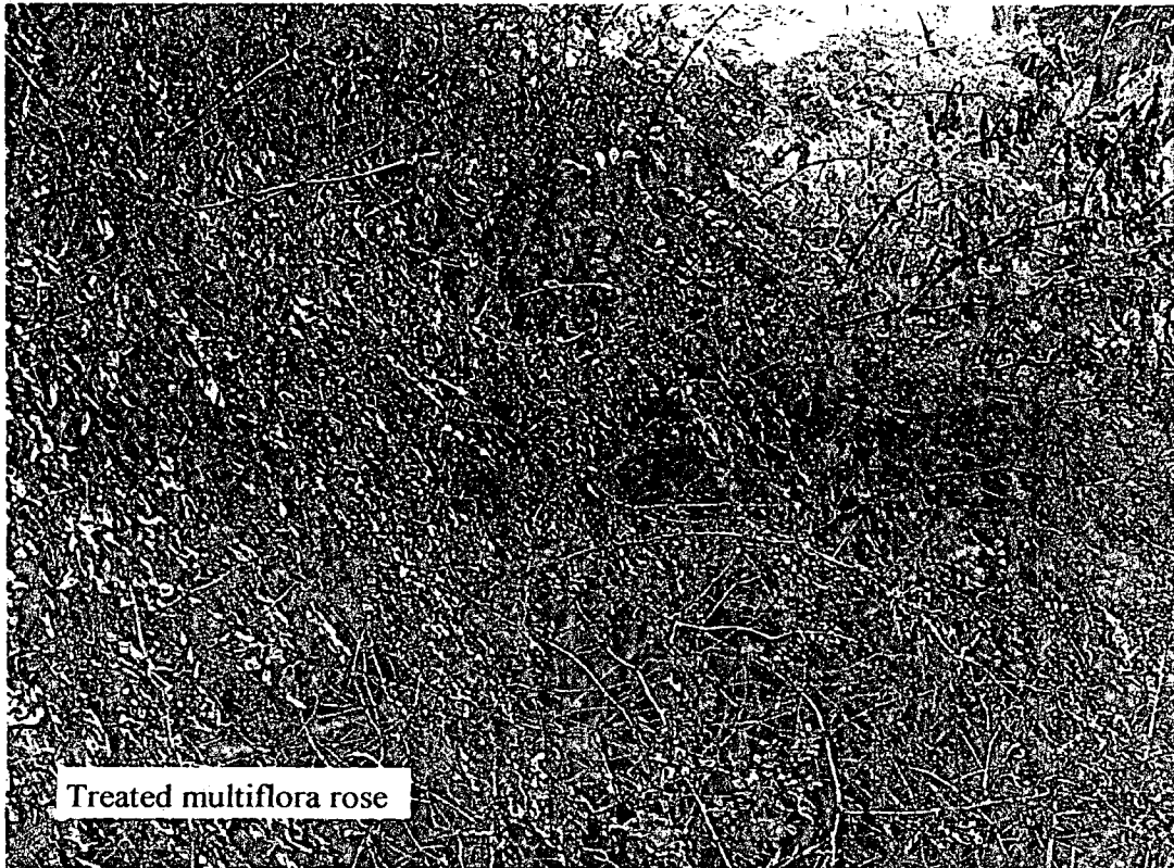
Treated multiflora rose