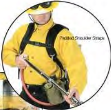
Padded Shoulder Straps