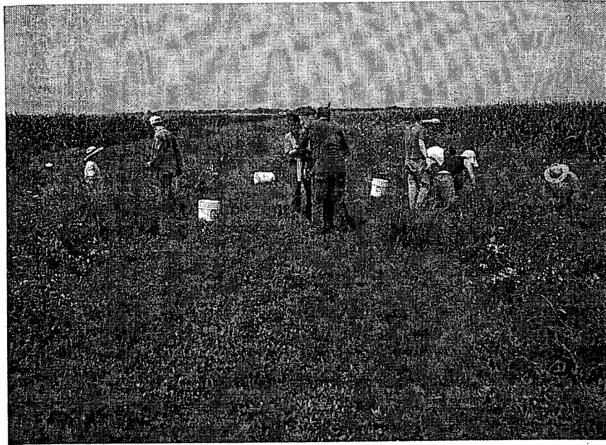
FIGURE 4: WORKDAY AT SHORTLINE PRAIRIE CONDUCTED BY INTERNS