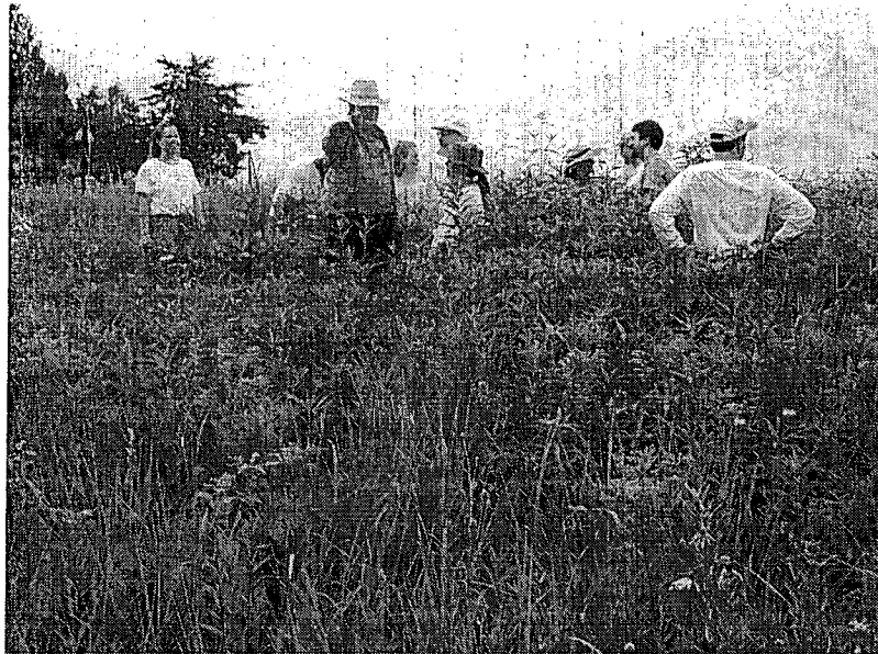
FIGURE 6: CONTROLLED BURNING AT PELLVILLE CEMETARY PRAIRIE