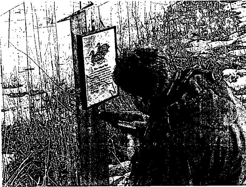
Volunteer installing one of the interpretive trail signs