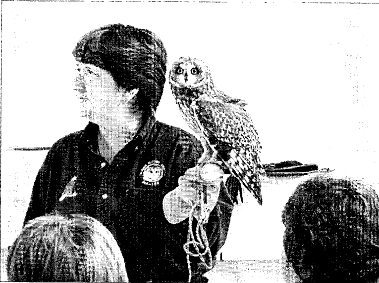
Hawk & Owl Programs