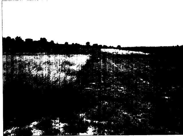
Looking south along west trail