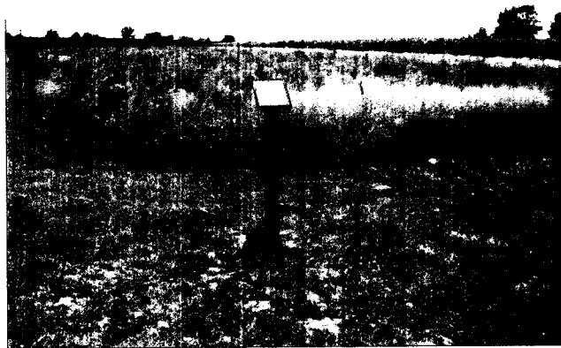
Looking south at first trail sign