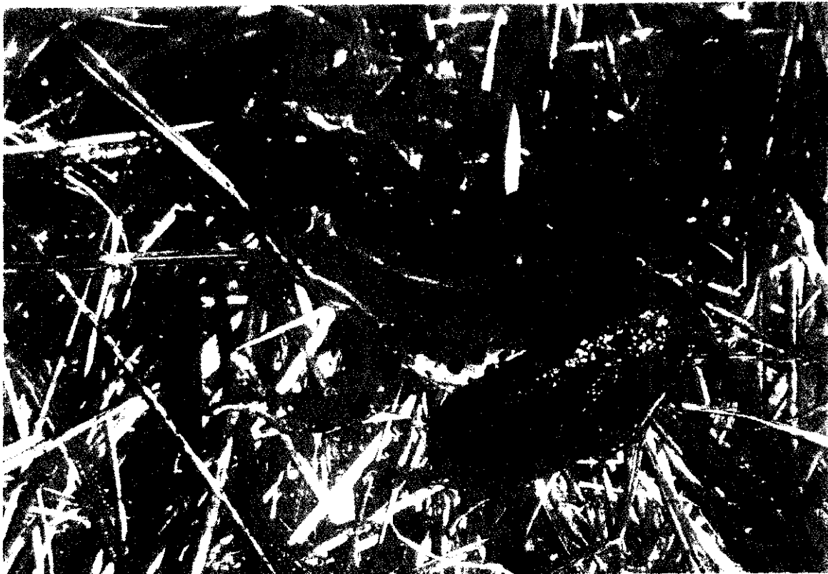
Northern Leopard Frog, Rana pipiens, Skokie River Preserve, Lake County, 2007.