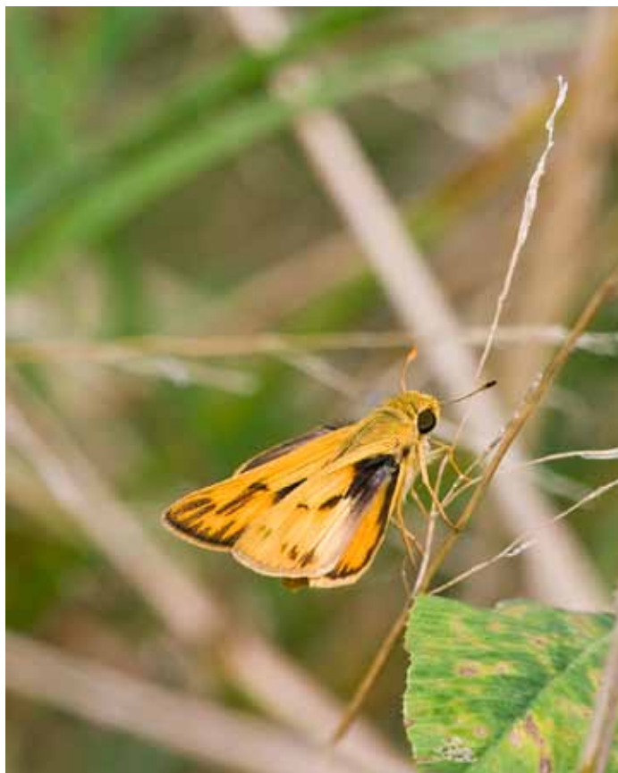
Fiery Skipper Hylephila phyleus

A total of 48 species of butterflies and skippers and 39 species of dragonflies and damselflies were recorded during this time period. A complete checklist is found on page 8. A very wet spring in 2009 prevented any surveying of the rivers within the project area until August. By this time many of the Gomphidae (clubtails) had quit flying. The rainy, cool weather affected the numbers of species seen on the observations. Some species were only seen once or twice. A total of 132 species were deposited at the Illinois State Museum. No Illinois Species of Conservation were found during the survey.