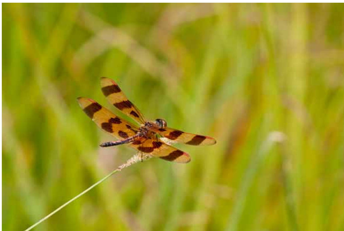
Halloween Pennant Celithemis eponina