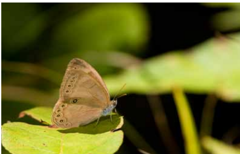
Appalachian Brown Satyroides appalachia

A project for the Illinois Department of Natural Resources Illinois Wildlife Preservation Fund Project #09-L12W