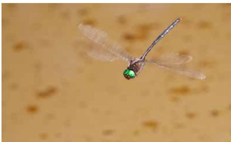
Mocha Emerald Somatochlora linearis