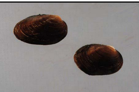
h) Toxolasma lividus