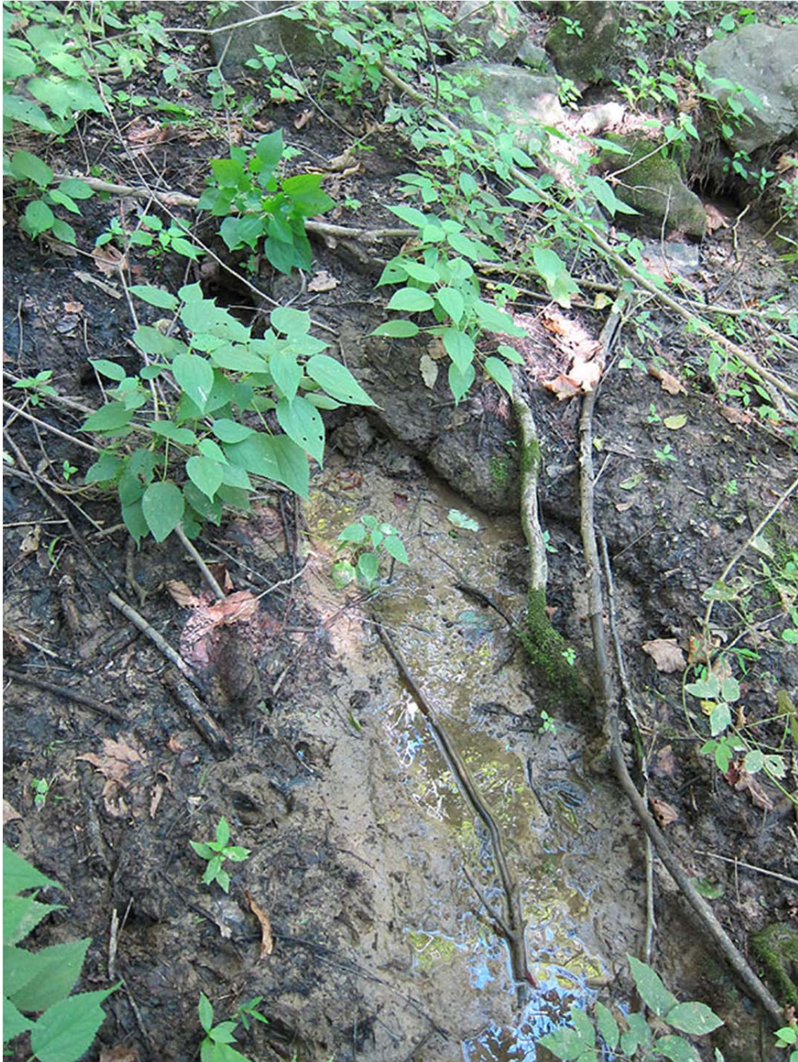
Figure 7 – Springhead at site sjt11-062, near Simmons Creek, Pope County, Illinois, 26 August 2011.