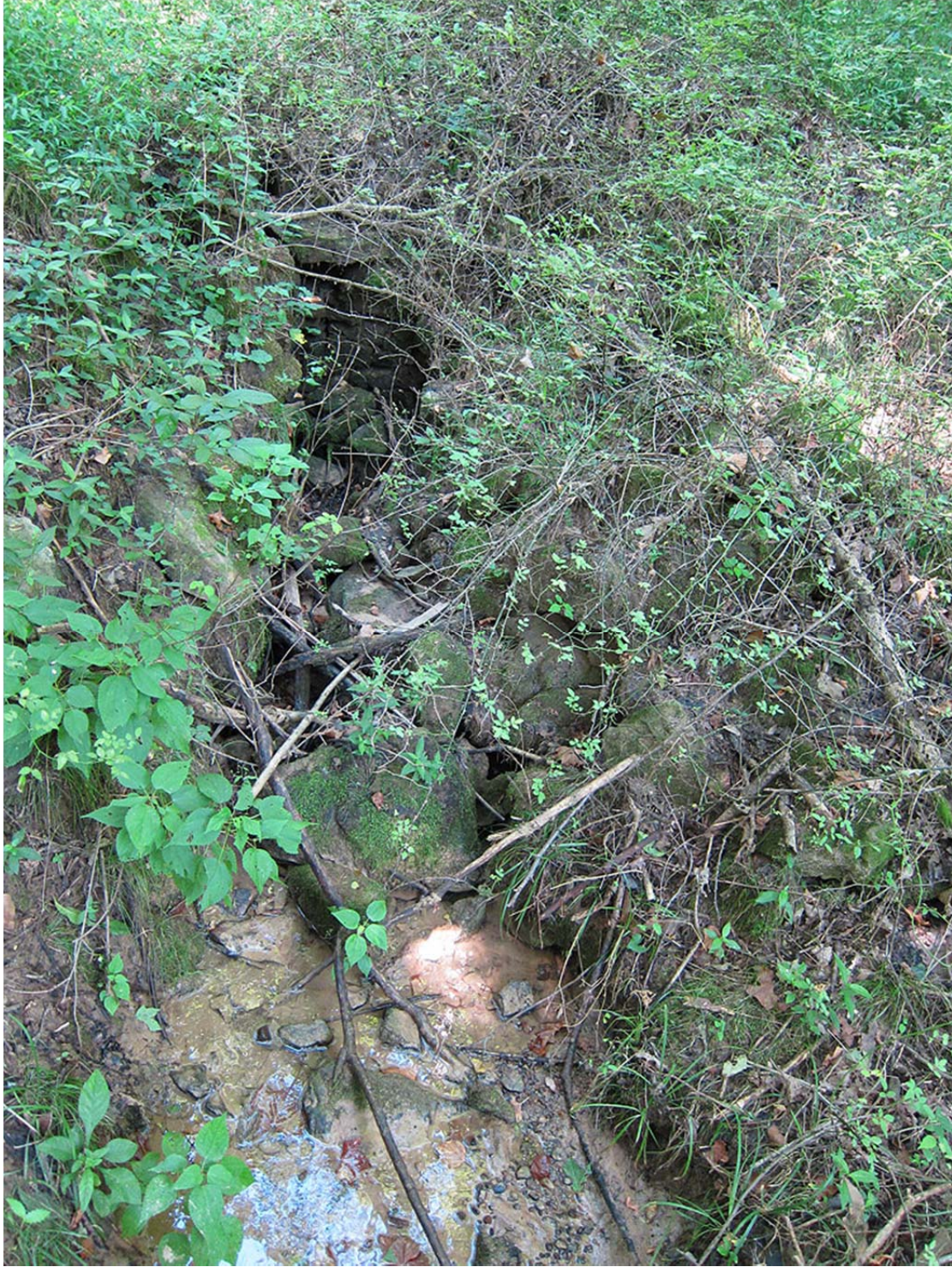
Figure 3 – Spring head at site sjt11-060, near Simmons Creek, Pope County, Illinois, 26 August 2011.