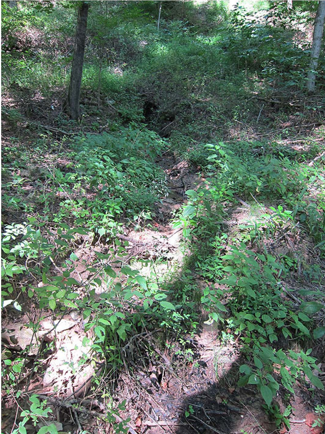
Figure 2 – Spring and mostly dry spring run at site sjt11-060, near Simmons Creek, Pope County, Illinois, 26 August 2011.