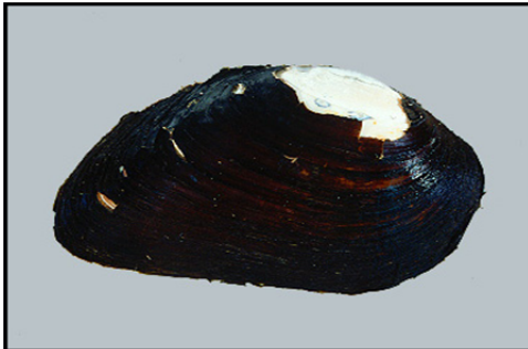
c) Elliptio crassidens