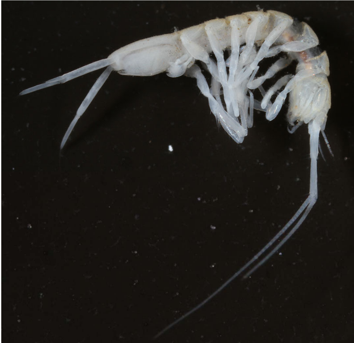
Figure 12 – Caecidotea sp. (Isopoda: Asellidae) from the spring at Grantsburg Swamp, Johnson County, Illinois, 27 August 2011.