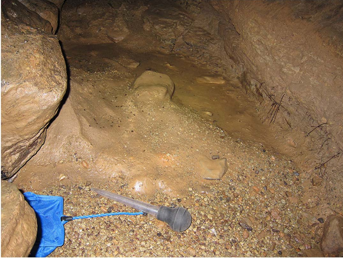
Figure 15 – Isolated, sediment bottom pool in otherwise dry stream bed in Equality Cave, Saline County, Illinois (7 August 2012). This is where Crangonyx packardi (Figure 16) was collected using a plastic turkey baster and an aquarium net.