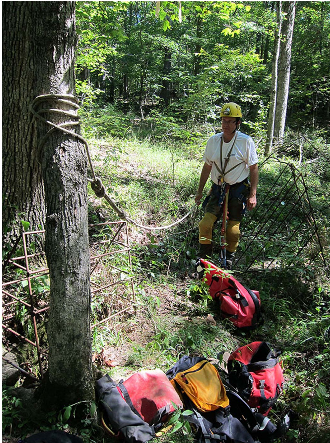
Figure 9 – Entrance area of Firestone Creek Cave (Johnson County, Illinois), 27 August 2011. Researcher is standing above main entrance. Rebar cages are, according to landowner, intended to keep livestock and people from accidentally falling into the cave. These covers are movable and not locked.