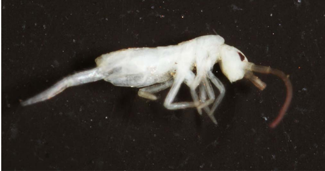
Figure 4 – Springtail (Collembola: Tomoceridae: probably Pogonognathellus flavescens ) from moss on rocks in spring head at site sjt11-060, near Simmons Creek, Pope County, Illinois, 26 August 2011.