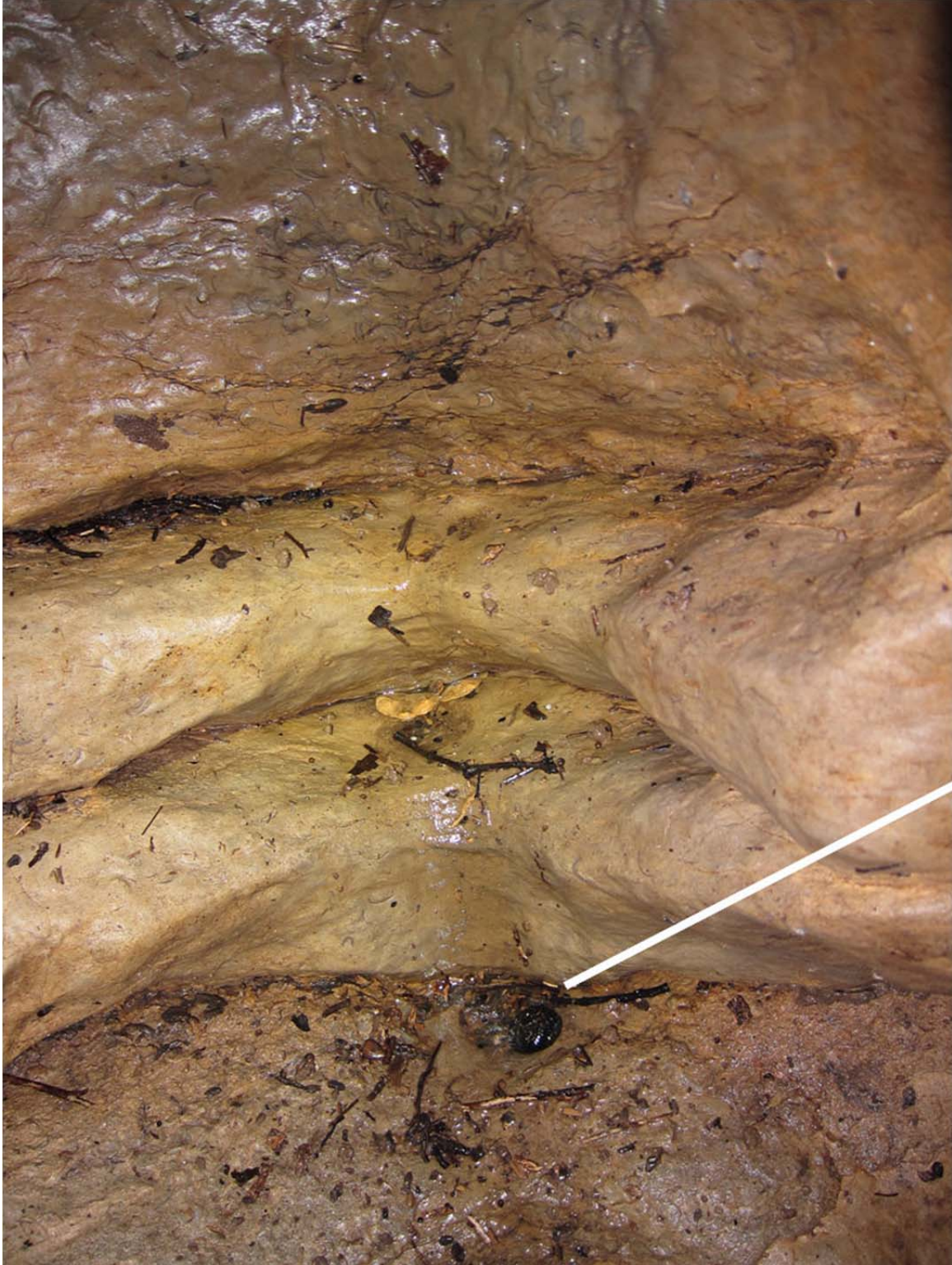
Figure 13 – Bedrock wall of Cave Spring Cave, Union County, with seeping water and organic debris. White line points to small (ca. 4 cm diameter) pool on bedrock wall ledge where Crangonyx sp. (Figure 14) was collected on 8 August 2012.