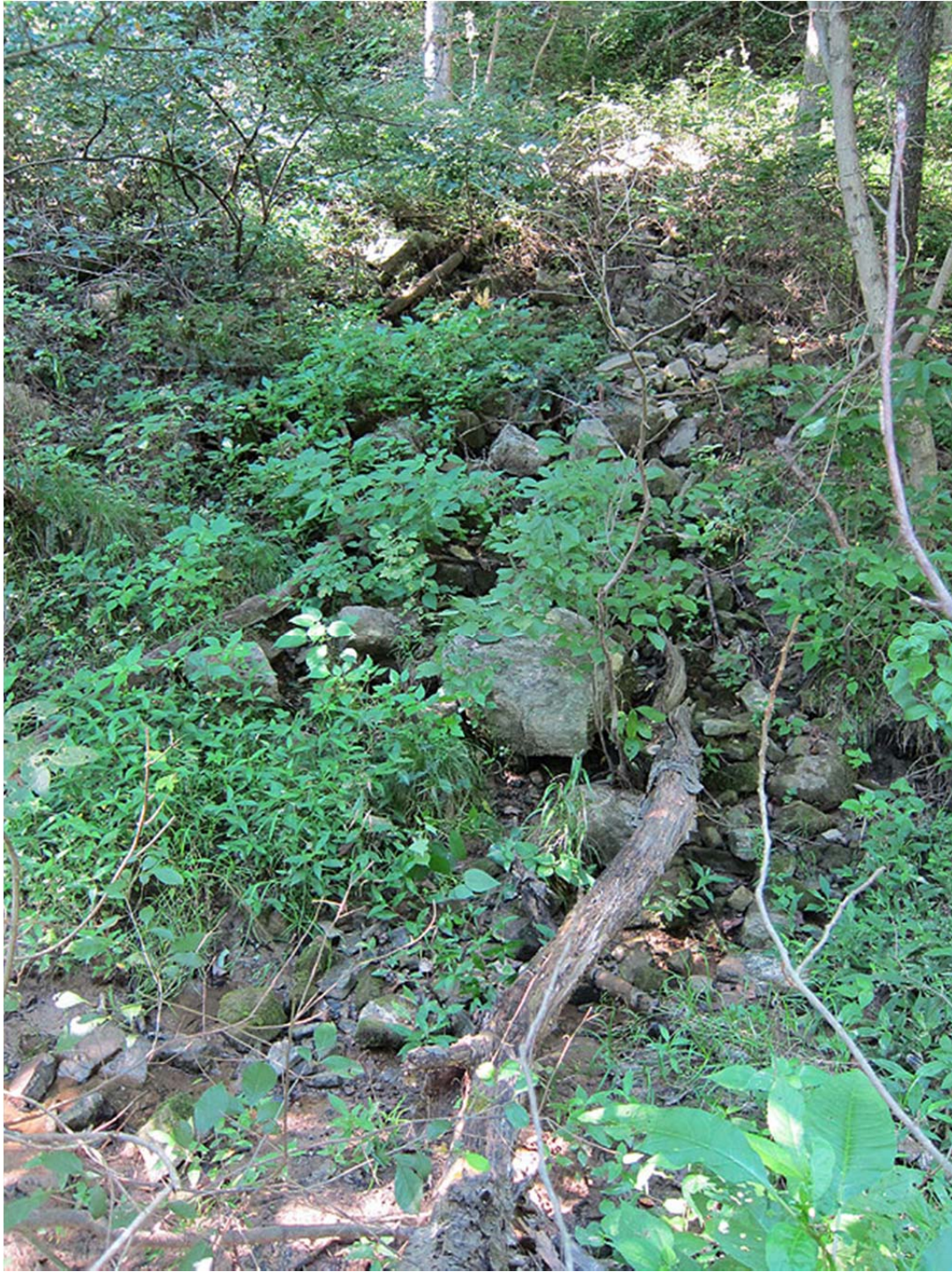
Figure 6 – Dry, intermittent spring run at Site sjt11-061, near Simmons Creek, Pope County, Illinois, 26 August 2011.