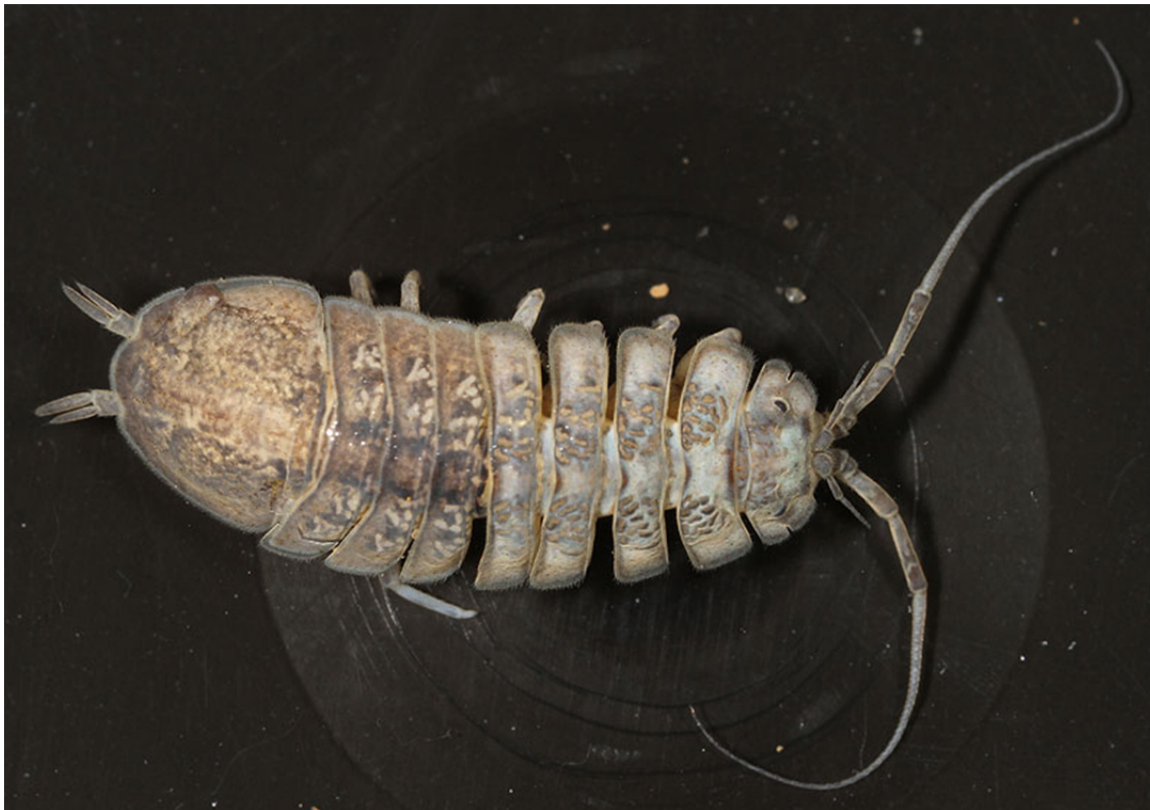
Figure 5 – Lirceus sp. (Isopoda: Asellidae) from moss on rocks in spring head at site sjt11-060, near Simmons Creek, Pope County, Illinois, 26 August 2011.