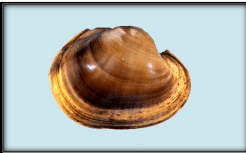
f) Potamilus capax