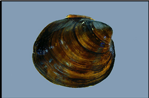
d) Fusconaia ebena