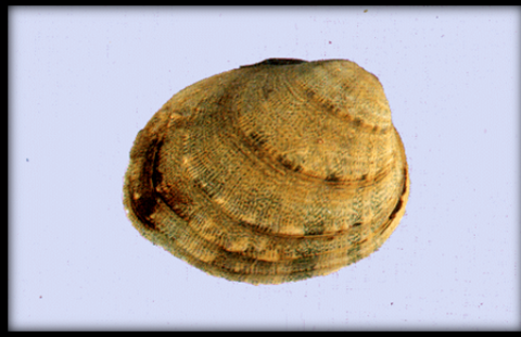
b) Cyprogenia stegaria