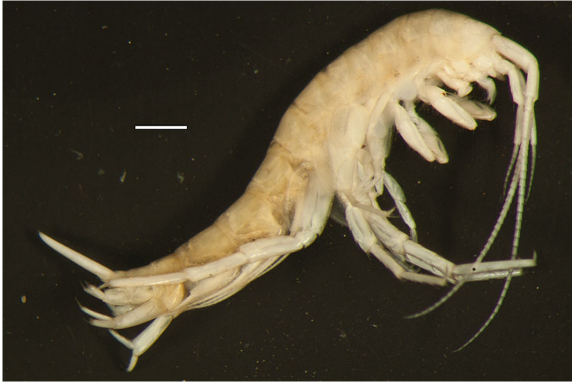
Figure 17 – Batrurus mucronatus from Equality Cave, Saline County, Illinois (7 August 2012). Note the absence of eyes and the well-developed posterior process that is diagnostic for this species in Illinois. Scale bar is 1 millimeter.