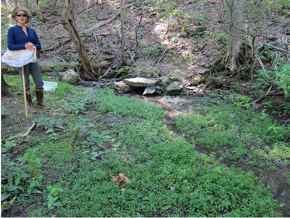
Figure 11 – Spring at Grantsburg Swamp, Johnson County, Illinois, 27 August 2011. Springhead is located under and around large stones at center of image. Green area in foreground and where researcher is standing is normally completely submerged, causing the swamp to back up into the springhead.