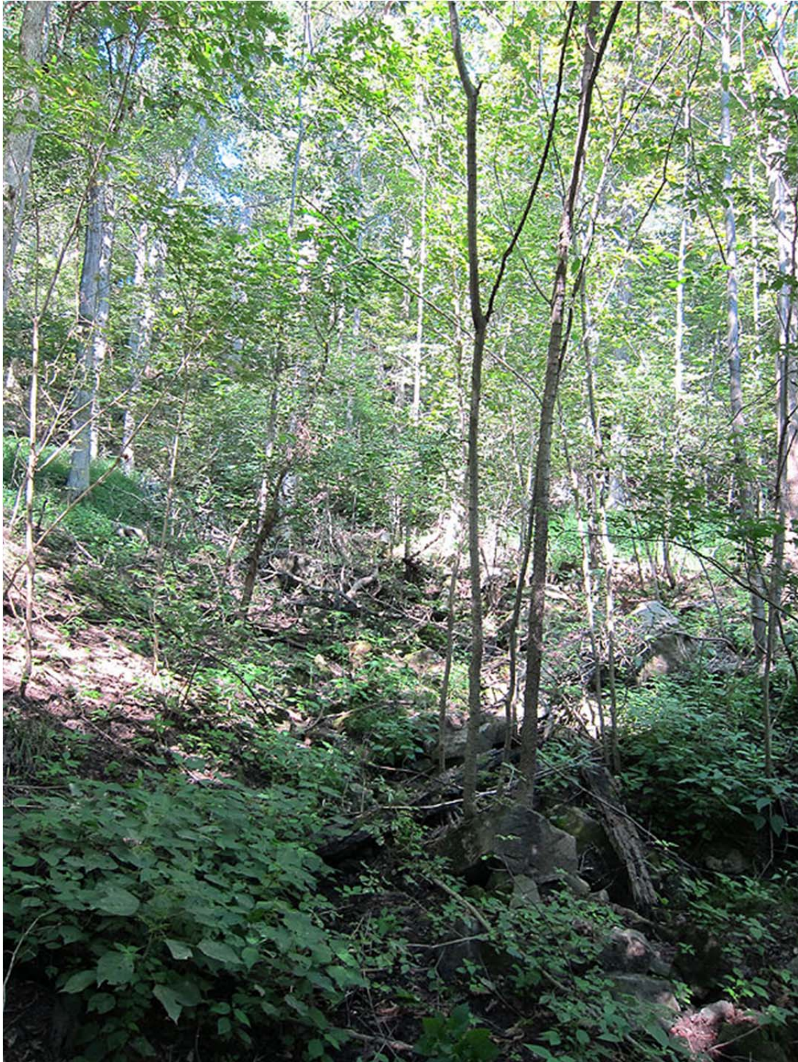
Figure 8 – Looking upstream along dry spring run to springhead of intermittent spring at Site sjt11-062, near Simmons Creek, Pope County, Illinois, 26 August 2011.