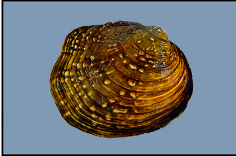
a) Cyclonaias tubercula