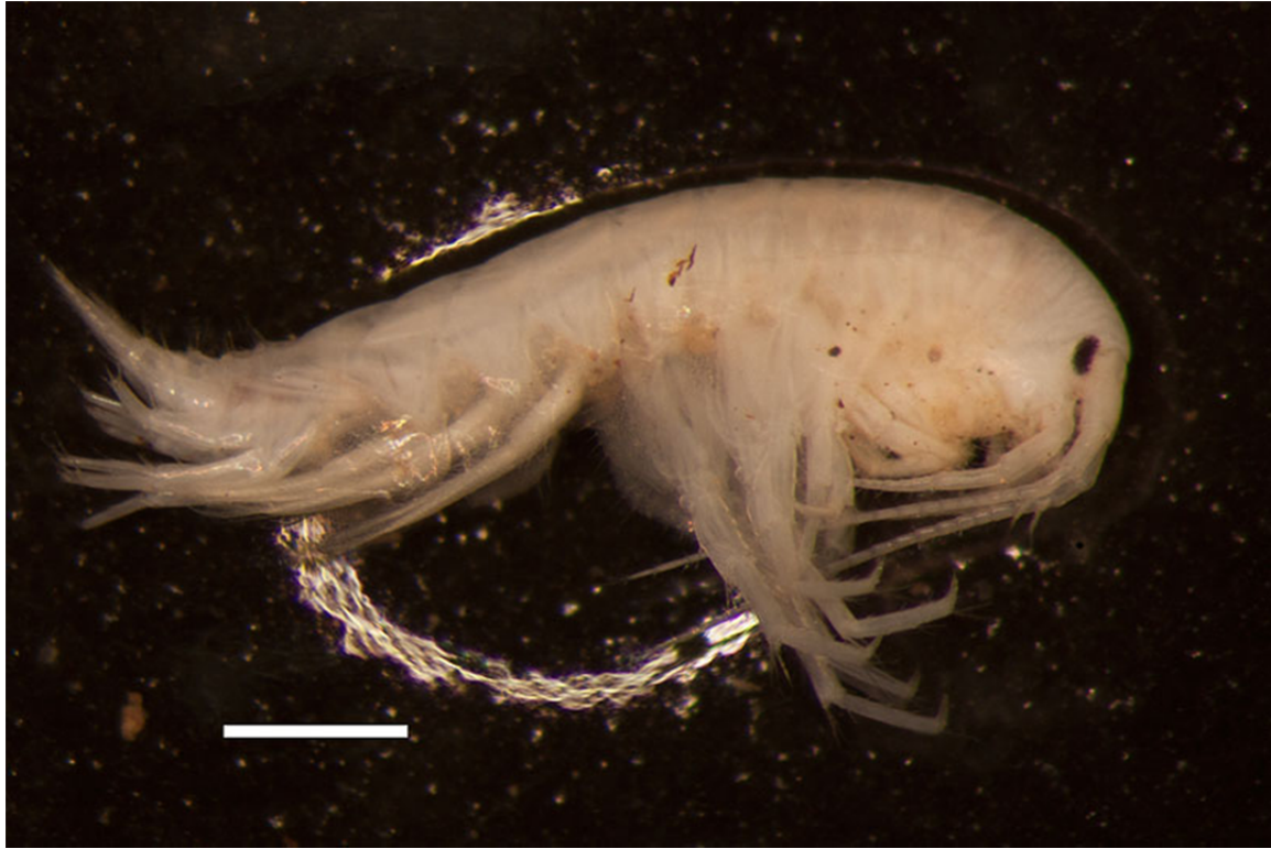
Figure 14 – Crangonyx sp. from Cave Spring Cave, Union County, Illinois (8 August 2012). Scale bar is 1 millimeter. Note the well-developed eye.