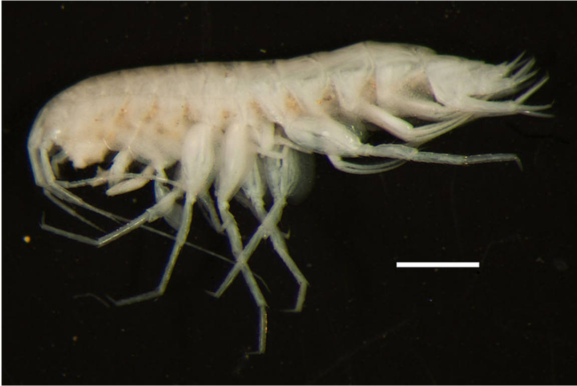
Figure 16 – Crangonyx packardi from Equality Cave, Saline County, Illinois (7 August 2012). Scale bar is 1 millimeter. Note the apparent absence of eyes, and relatively slender antennae in comparison to the eyed species of Crangonyx shown in Figure 14.