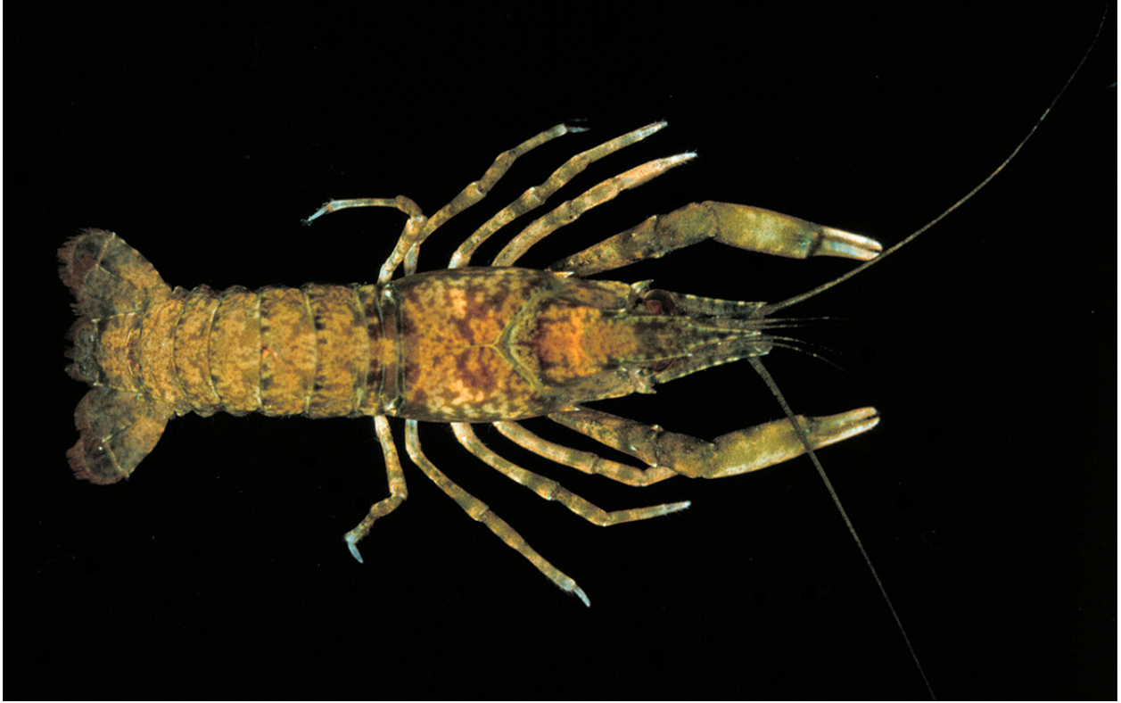
Figure 18 – Shrimp crayfish Orconectes lancifer .