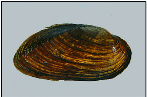
g) Elliptio dilatata