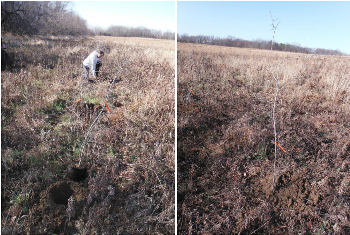
Planting a row of native shrubs and a planted shrub on the Loy Prairie Restoration