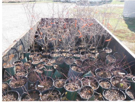
Photos of the native shrubs, grasses and wetland plants purchased with WPF monies.

All of the prairie forb seed was freeze and thawed onto the prairie restoration areas on the Loy Prairie during February 2012 by volunteers; this allowed the seed to freeze and thaw into the soil which will allow for germination in the spring of 2012. Many of these prairie forb species that were purchased were specific prairie forb seed and plants that are utilized by insect species of conservation concern and were planted in an effort to establish populations of these species on the Loy Prairie. Twelve Mile Prairie is located along the east boundary of the Loy Prairie restoration, which will provide a source population for plant and animal colonization. Several Illinois species of conservation concern are known from the 12 Mile prairie corridor.