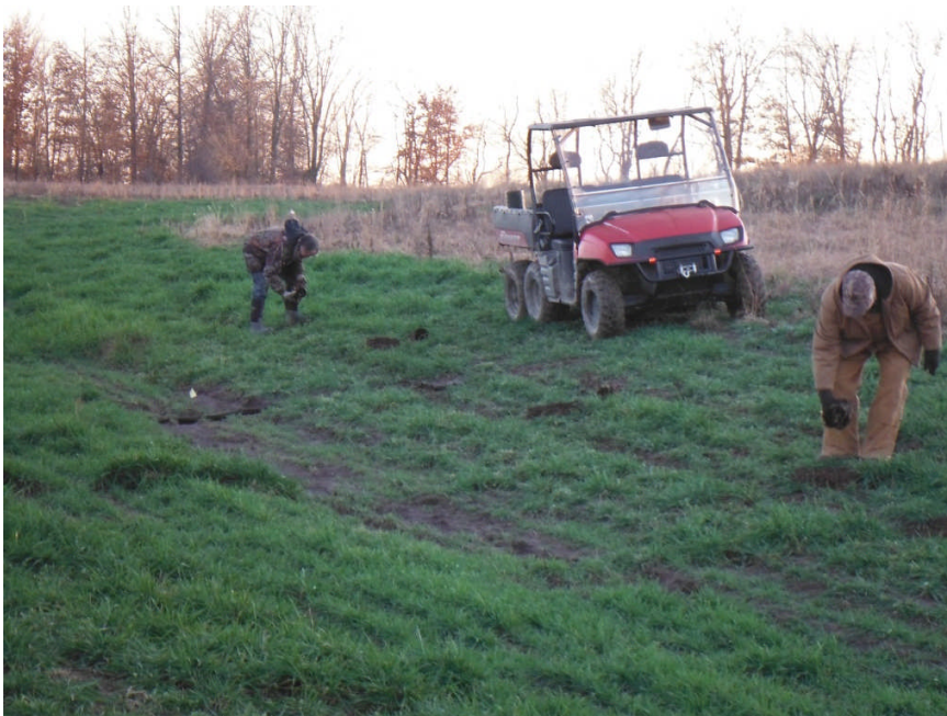
Planting prairie cordgrass plugs on the Loy Prairie Restoration in Marion County