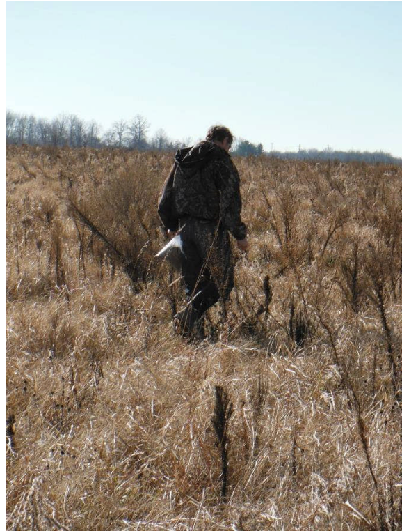
Spreading Forb Seed on the Loy Prairie Restoration

The following is a list and amounts of the prairie forb seed purchased with $3993.30 worth of grant funds. 1 lb. Aster laevis Smooth Aster, 1 lb. Astragalus canadensis Canada Milkvetch, 2 lb. Cassia fasciculata Partridge Pea. 1 lb. Coreopsis tripteris Tall Coreopsis, 1 lb. Desmanthus illinoensis Illinois Bundle Flower, 1 lb. Desmodium canadensis Showy Tick Trefoil, 1 lb. Desmodium illinoense Illinois Tick Trefoil, 1 lb. Echinacea pallida Pale Purple Coneflower, 5 lb. Eryngium yuccifolium Rattlesnake Master, 3 lb. Heliopsis helianthoides , Early (False) Sunflower, 3 lb. Lespedeza capitata Round-headed Bush Clover, 1 lb. Liatris aspera Button Blazing Star, 1 lb. Liatris pycnostachya Prairie Blazing Star, 1 lb. Monarda fistulosa Wild Bergamot, 1 lb. Parthenium integrifolium Wild Quinine, 1 lb. Penstemon pallidus Pale Beardtongue, 4 lb. Ratibida pinnata Yellow Coneflower, 2 lb. Rudbeckia hirta Black-eyed Susan, 1 lb. Silphium integrifolium Rosinweed, 2 lb. Silphium laciniatum Compassplant, 1 lb. Solidago rigida Stiff Goldenrod and 2 lb. Zizia aurea Golden Alexanders.