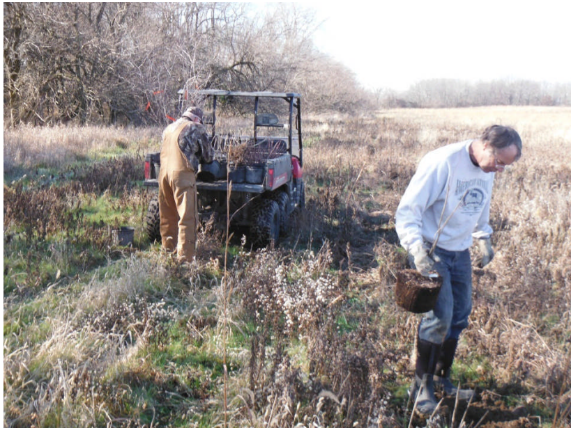
Planting native shrubs on the Loy Prairie Restoration

prior to the spring growing season. The shrubs were planted in seven different locations in two groups of 20 and five groups of 40, these groupings allow for shrub communities to be established and higher survivability. These shrub colonies should provide habitat for shrubland dependent wildlife. See attached map for locations of the shrub plantings.