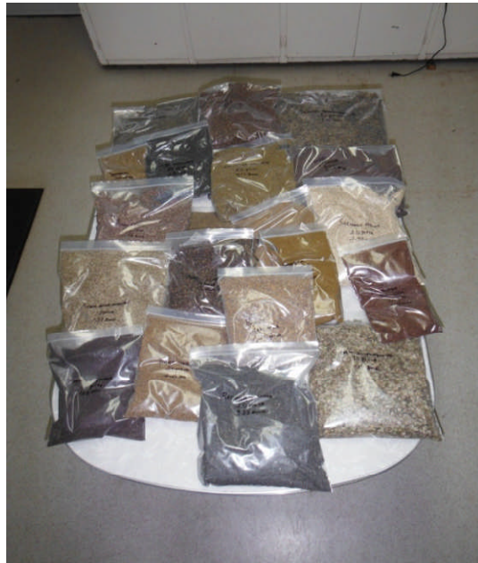
Prairie Forb Seed purchased for the Loy Prairie Project with the Wildlife Preservation Fund Grant

All of the prairie forb seed was freeze and thawed onto the prairie restoration areas on the Loy Prairie during February 2012 by volunteers; this allowed the seed to freeze and thaw into the soil which will allow for germination in the spring of 2012. Many of these prairie forb species that were purchased were specific prairie forb seed and plants that are utilized by insect species of conservation concern and were planted in an effort to establish populations of these species on the Loy Prairie. Twelve Mile Prairie is located along the east boundary of the Loy Prairie restoration, which will provide a source population for plant and animal colonization. Several Illinois species of conservation concern are known from the 12 Mile prairie corridor.