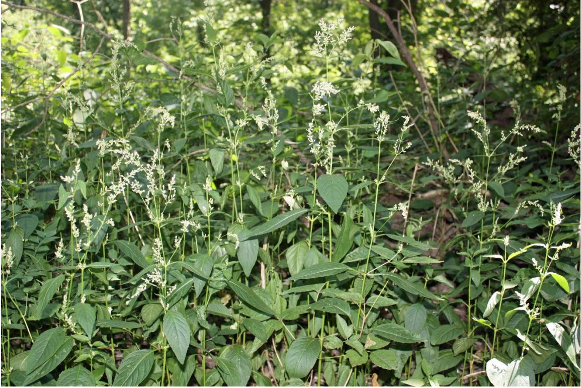
Photo 1. Flowering population of Iresine rhizomatosa at Beall Woods Nature Preserve. July 24, 2012.