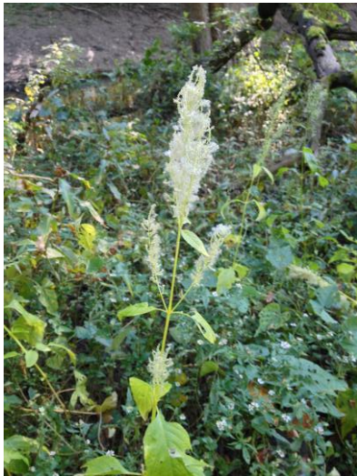
Flowering female (7 + nodes) at .....