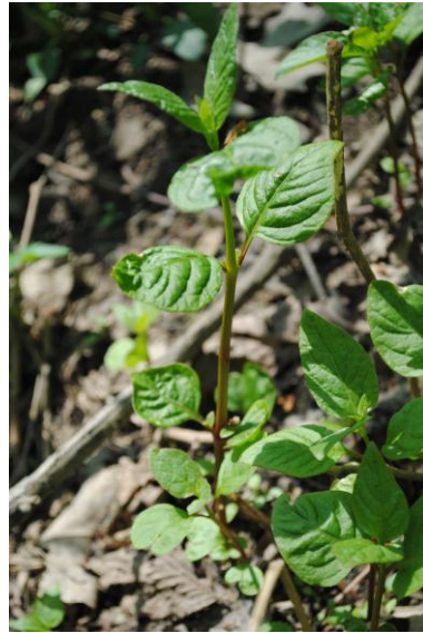
Juvenile (4-6 nodes) at ...