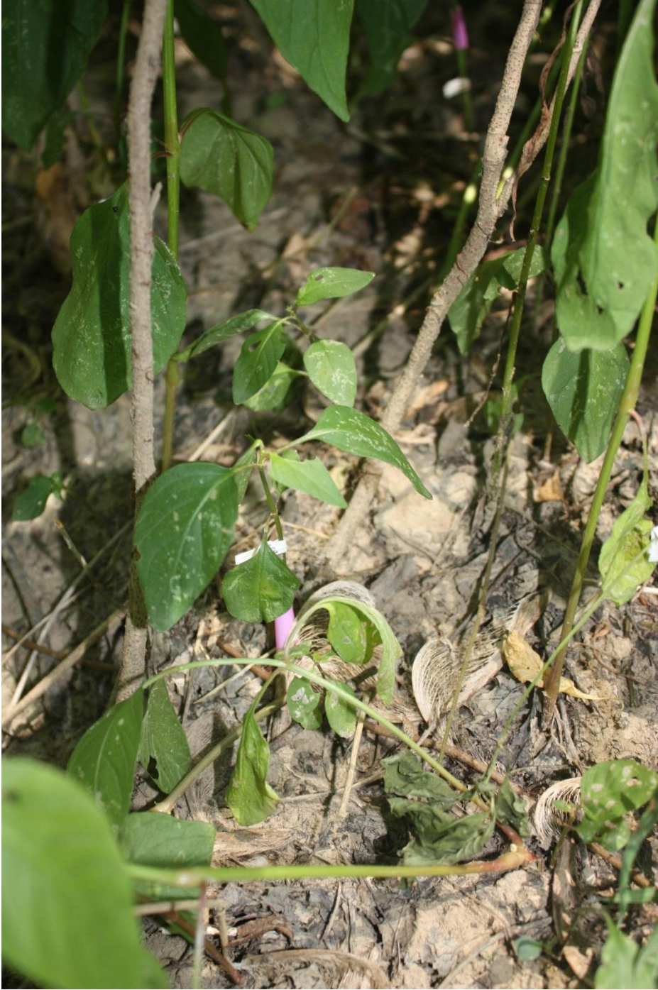
Photo 3. Tagged seedling of Iresine rhizomatosa at Beall Woods Nature Preserve. July 24, 2012.