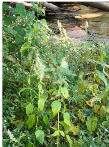
Photo 4: Composite figure showing a) a seedling, b) a juvenile, c) a flowering adult female, and d) population view of Iresine rhizomatosa at Beall Woods State Park