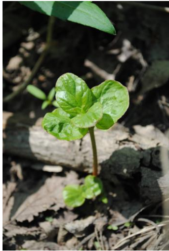
Seedling (1-3 nodes) at ..