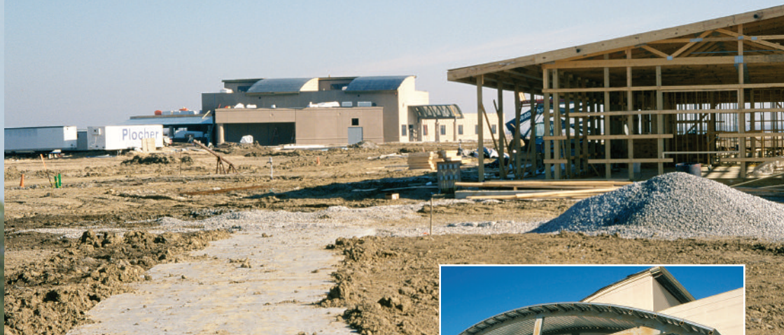
The Events Center (above center and right) serves as the hub for shooting sports, meetings and dining.