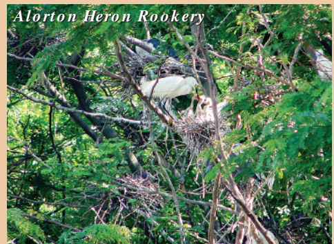
Alorton Heron Rookery

Endangered species often require a very specific habitat type to survive, such as a tamarack bog or sand prairie. When the habitat type, or natural community, is itself extremely rare, the animals and plants dependant on it decline. DNR uses the NAAF money to target acquisition of rare habitat types seldom present in the state parks or county forest preserves.