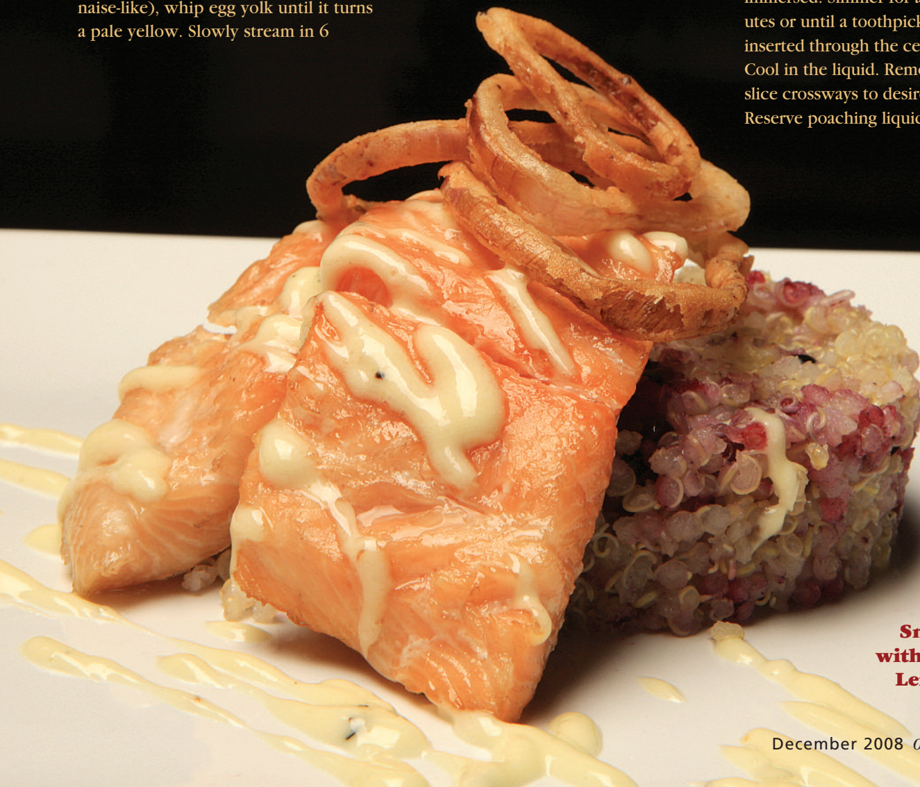
Smoked Trout with Blackberry- Lemon Quinoa

Heat blackberry wine with cinnamon stick, bay leaves and cloves to 190° F. Add pears to poaching liquid, ensuring they are completely immersed. Simmer for about 25 minutes or until a toothpick can be inserted through the center with ease. Cool in the liquid. Remove pears and slice crossways to desired thickness. Reserve poaching liquid.