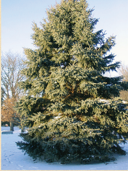
Conifers, such as the square-needed Colorado spruce, and hardwoods provide aesthetic diversity.

North of the Bone memorial, Schmidt pointed out a bald cypress, a deciduous conifer similar to those found in southern Illinois cypress swamps.