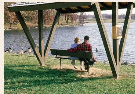
(DNR staff photo.)

While the focus of an outing may change with the seasons, Morrison-Rockwood State Park offers something for everyone.