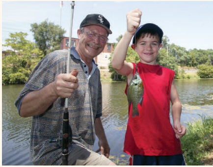
Volunteers cleared and rewatered parts of the canal in the 1970s. Anglers of all ages now enjoy fishing the I&M Canal.

portation halted when the canal froze) is now covered in limestone screenings, providing full-season use.