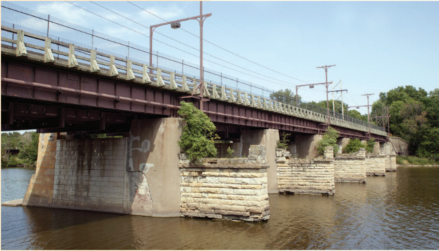
Where water once flowed through the 464-foot Fox River aqueduct at Ottawa, bikers and hikers now traverse.

“The I&M Canal corridor is an amazing natural, cultural and historical resource...”