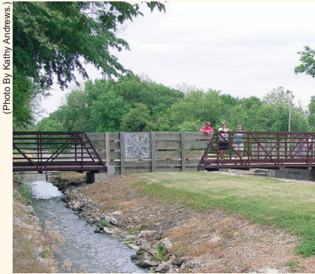
A walkway at Aux Sable provides visitors an overview of the lock.

Mule tenders walked the single towpath, guiding mules tethered to the barge by a 100-foot rope. When barges met, a carefully choreographed routine