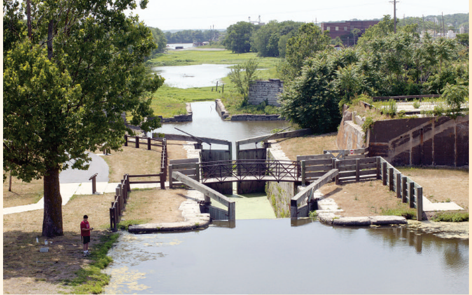
Lock 14 at LaSalle was reconstructed in the 1970s. Remnants of Lock 15, and the Illinois River, appear beyond the lock.

Barges laden with passengers and goods slipped down the prism-shaped canal, passing through the 15 locks between Lockport and LaSalle that adjusted for the 141-foot change in elevation and stopping at developing communities. Wooden aqueducts carried boats across two rivers and two streams. Warehouses and grain elevators, called “cathedrals of the prairie,” sprung up along the corridor to hold merchandise and crops.