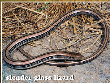
slender glass lizard