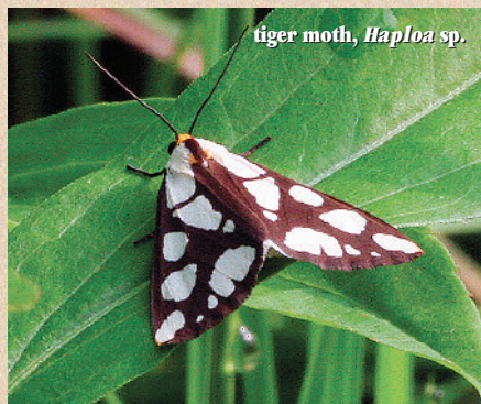
tiger moth, Haploa sp.