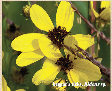
beggar's ticks, Bidens sp.