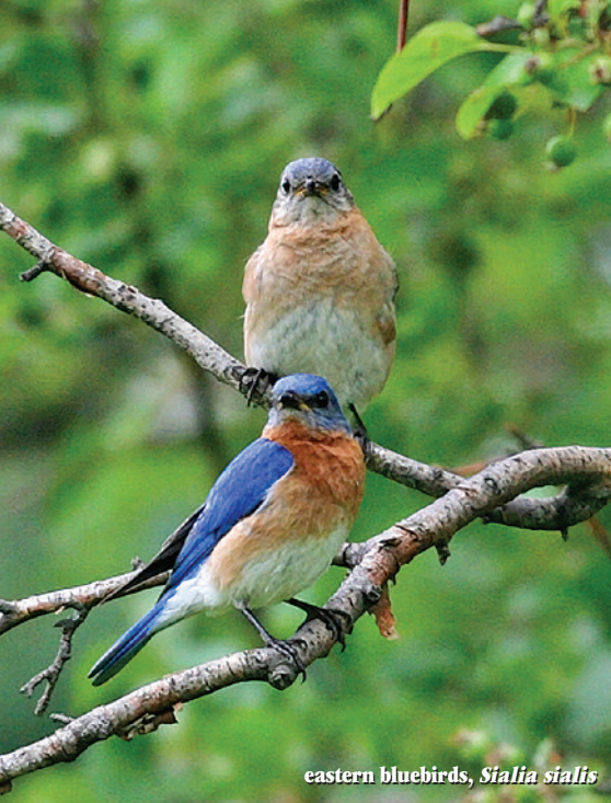
eastern bluebirds, Sialia sialis