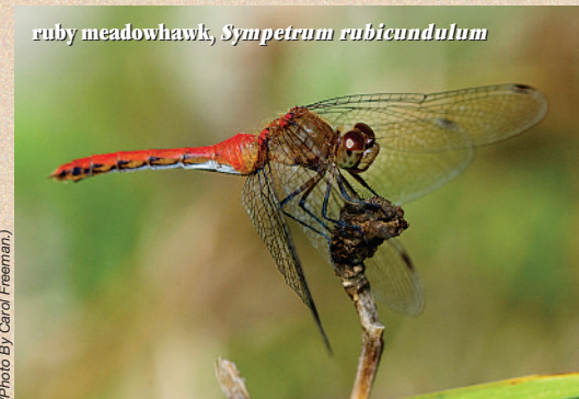
ruby meadowhawk, Sympetrum rubicundulum