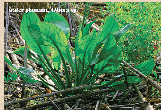
water plantain, Alisma sp.