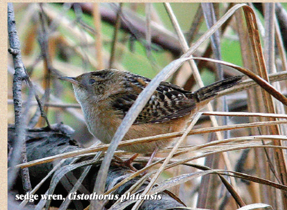
sedge wren, Cistothorus platensis