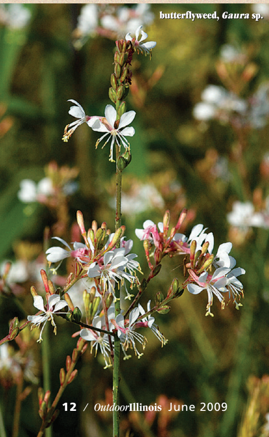
butterflyweed, Gaura sp.

The Pottawatomi village of Sauganaka remained within the boundaries of Wolf Road Prairie following the Blackhawk War of 1833. By 1852, a farming community existed in the area; however some sections were too wet to plow or graze extensively and remained largely untouched. The community of Westchester was incorporated there in 1926.