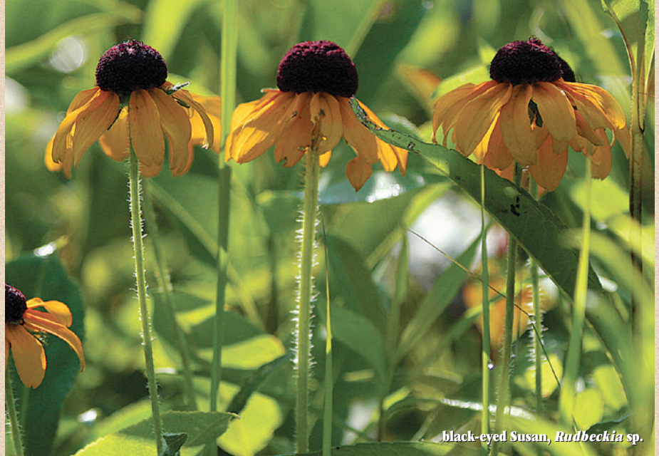
black-eyed Susan, Rudbeckia sp.