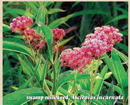
swamp milkweed, Asclepias incarnata