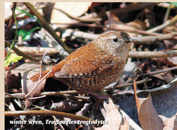
winter wren, Troglodytes troglodytes