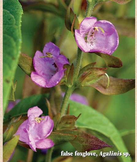
false foxglove, Agalinis sp.

In addition to expanses of prairie habitat, Wolf Road contains a high-quality bulrush-cattail marsh and a small savanna remnant that is dominated by bur oak with wild hyacinth, ground nut and meadow rue beneath the trees.