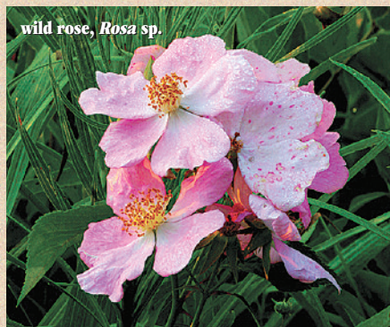
wild rose, Rosa sp.

Wolf Road Prairie contains more than 370 documented species of native plants, and more than 140 species of birds can be sighted there throughout the year. Vertebrates recorded at Wolf Road include western chorus frog, fox snake, woodchuck, common snipe and swamp sparrow.