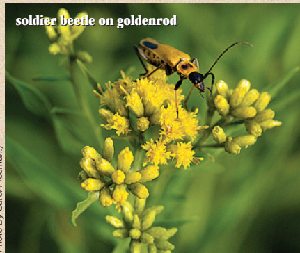
soldier beetle on goldenrod

In the 1920s, the prairie was subdivided into nearly 600 lots for housing and commercial development, roads were graded and sidewalks were laid. But, before water and sewer lines could be installed, the Great Depression struck. The lack of utilities, zoning issues and fragmented ownership kept the project from proceeding when the economy improved. Interest in preserving the unique prairie habitat spurred the Save the Prairie Society, a not-for-profit organization chartered in 1975, to start acquiring small parcels in 1980. The Department of Natural Resources and Forest Preserve District of Cook County began jointly acquiring parcels in the 1990s. The Illinois Nature Preserves Commission dedicated a 55.05-acre nature preserve in September 1988. Nearly 125 acres are now preserved, including buffers, purchased with Open Land Trust and Natural Areas Acquisition funds, to protect the watershed and biodiversity of the natural area.