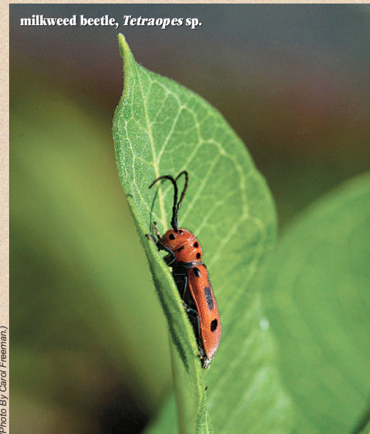
milkweed beetle, Tetraopes sp.

Programs: The Save the Prairie Society offers free programs or guests can wander in at will. The entrance kiosk will contain notices about restoration work, photos and posters illustrating which flowers and grasses are in bloom and a schedule of programs.