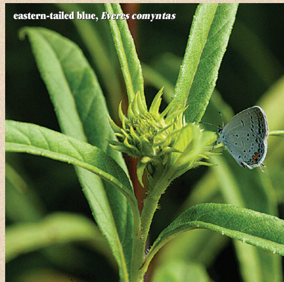
eastern-tailed blue, Everes comyntas