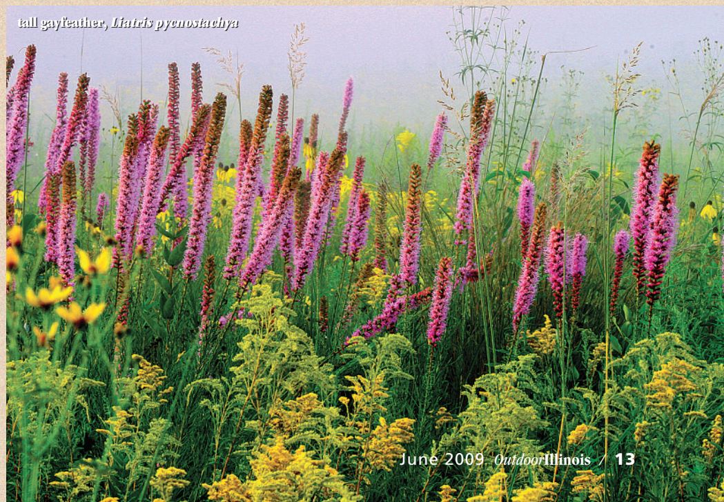
tall gayfeather, Liatris pycnostachya