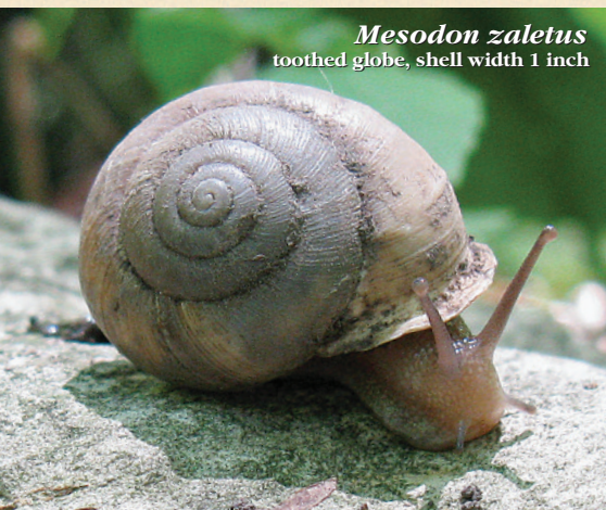
Mesodon zaletus toothed globe, shell width 1 inch

The toothed globe snail (also top of page) is widely distributed in Illinois and common in hardwood forests.