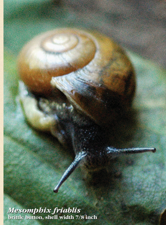
Mesomphix friabilis brittle button, shell width 7/8 inch

Also notable is that the majority of Illinois' species are quite small—less than 1/4 inch in shell width—and most of these inhabit the leaf litter of forested areas. They might be hard to detect by the unaided (and unknowing) human eye, but they exist, and are doing their jobs very well.