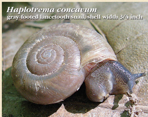
Haplotrema concavum gray-footed lancetooth snail, shell width 3/4 inch

A few snail species in Illinois are carnivorous, either in part or as specialists.