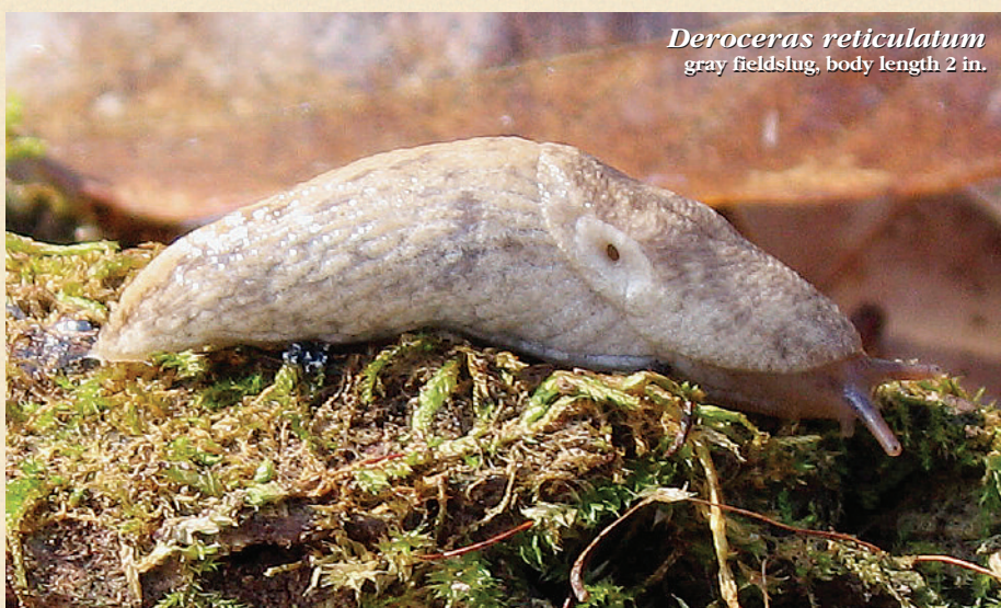
Deroceras reticulatum gray fieldslug, body length 2 in.