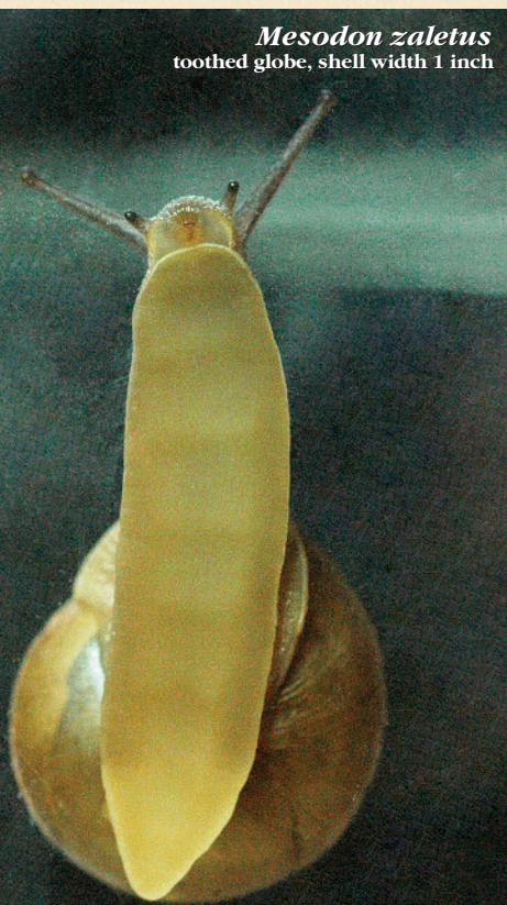
Mesodon zaletus toothed globe, shell width 1 inch

The only predatory land snail in Illinois, the gray-footed lancetooth (above) extends its long neck into the shell of other snails.