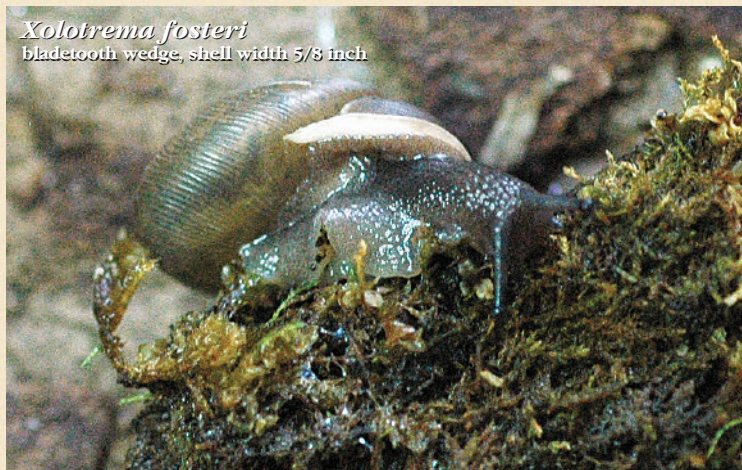
Xolotrema fosteri bladetooth wedge, shell width 5/8 inch

Named for the toothlike structure on the shell, the bladetooth wedge is one of the most common land snails in Illinois.