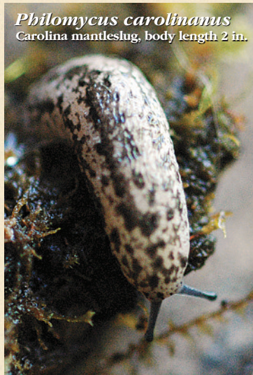
Philomycus carolinanus Carolina manteslug, body length 2 in.

Land snails glide on a large, muscular foot that contracts in waves in the direction the animal is moving. Glands in the foot produce mucus that aids in movement.