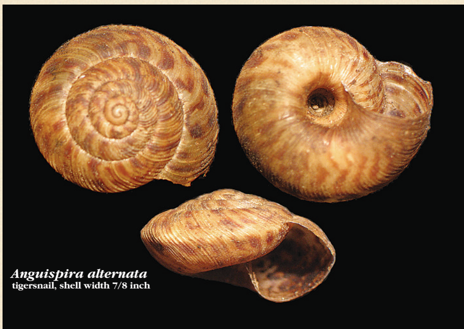
Anguispira alternata tigersnail, shell width 7/8 inch

The vivid, rust-color marking on the tigersnail make it easy to identify this common snail.