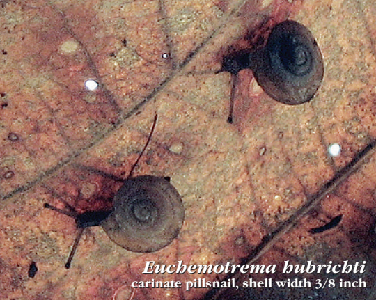
Euchemotrema hubrichti carinate pillsnail, shell width 3/8 inch

base of the food chain, meaning there are plenty of predators relying on snails for their dietary needs. A great diversity of animal life feeds upon land snails, from insects to lizards and snakes, salamanders, birds and mammals. Some species of fireflies consume snails exclusively during their larval stage.