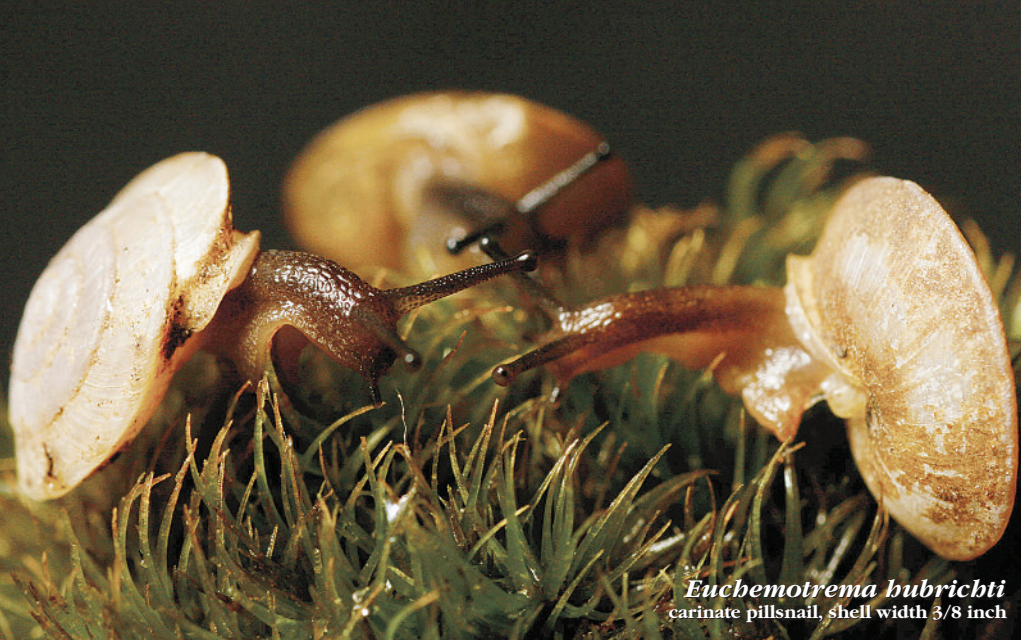
Euchemotrema hubrichti carinate pillsnail, shell width 3/8 inch