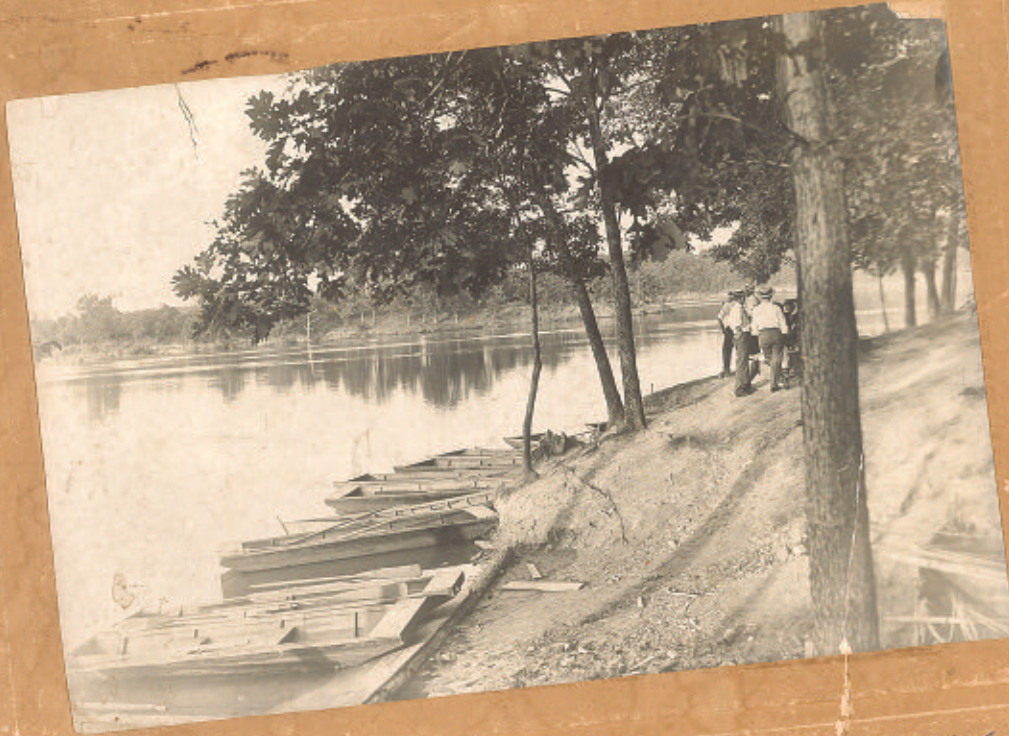
BEAVER DAM LAKE 1909