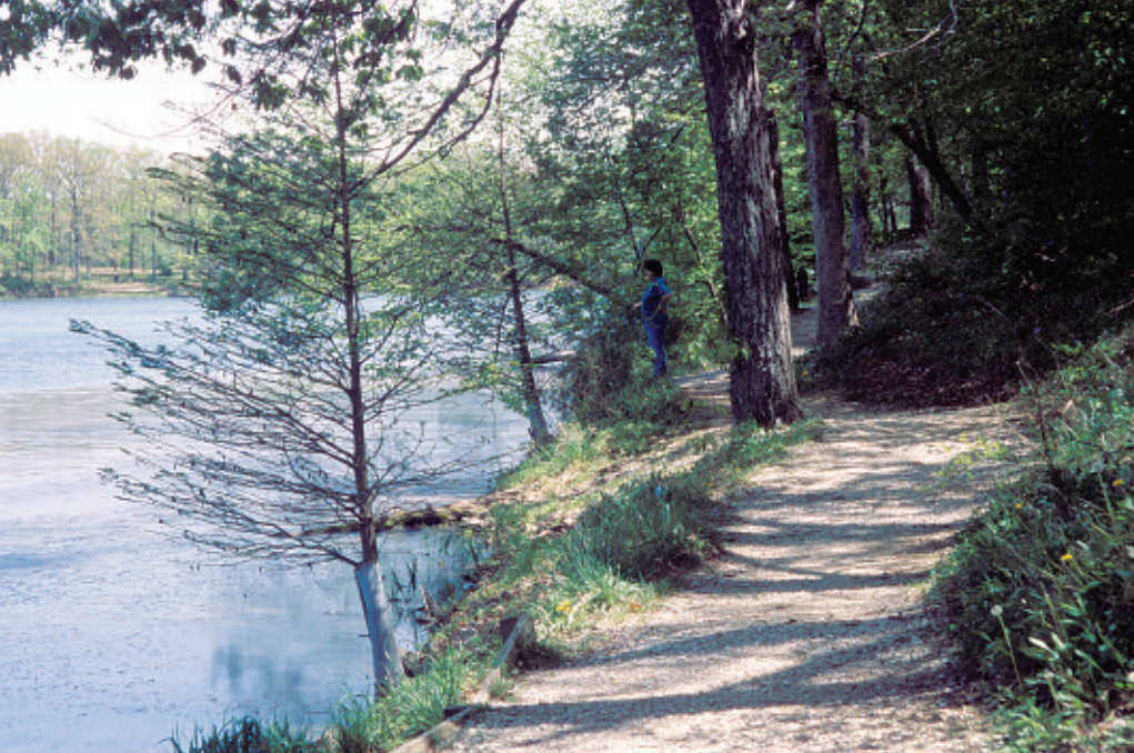
Vegetation has grown up along the Beaver Dam Lake shoreline, providing a shaded backdrop for hikers and bank anglers.

Just inside the woodland, two researchers from the Illinois Natural History Survey (INHS) knelt around a one-quarter square meter quadrant plot, one calling out the names and abundances of plants within the boundary, the other recording the information for analysis in the office.