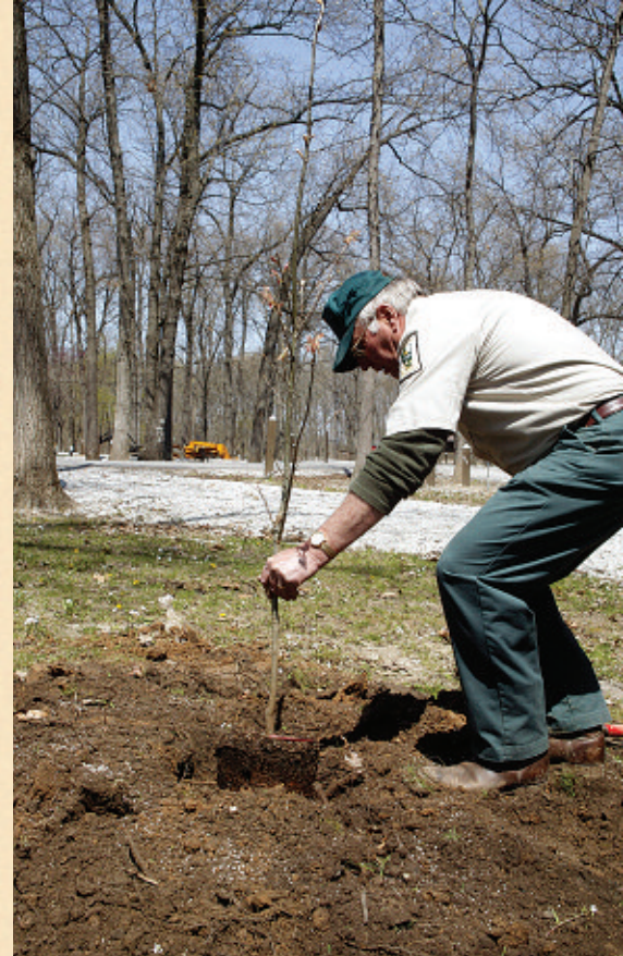
As dead, diseased and hazardous trees are removed, Beaver Dam State Park staff replace them with native oaks.

The scenic Macoupin Creek Valley where the park now sits has attracted humans for thousands of years. Native American hunting parties found plentiful wild game—deer, turkey, elk, bison, waterfowl—in the valley and several prehistoric camp sites and grave sites have been found along the waterway. Along the stream they also found bountiful, edible plants, like the roots of arrow arum, called by one tribe “ma-cou-pin-a” and the source of many place names in the area. A large, red, carved sandstone ceremonial pipe found in the area documents trading with Mayans during the mid-Mississippian culture.