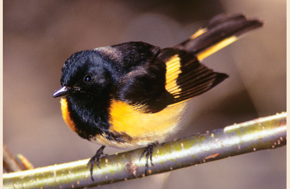
The Swainson's warbler (left) is a "find" for anyone who enjoys bird-watching. The American redstart (above) is perhaps the most recognizable of the warblers with his striking black and orange contrast.

part of the observer. Persistence, tolerance for insects, snakes, heat and tough slogging (and a good dash of luck), all play a part in increasing one's chances of getting a good look at him. The magnificent swamps and cane thickets of the southeastern United States provide the preferred habitat for this bird; however, a few Swainson's warblers reach the moist bottomlands of southern Illinois.