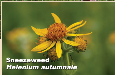
Sneezeweed Helenium autumnale