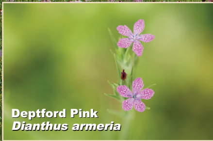
Deptford Pink Dianthus armeria