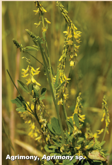
Agrimony, Agrimony sp.