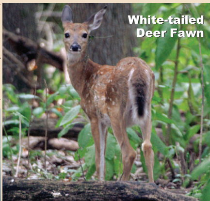
White-tailed Deer Fawn