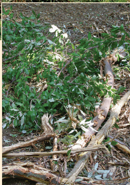
Removing autumn olive and other invasive shrubs enhances wildlife values.