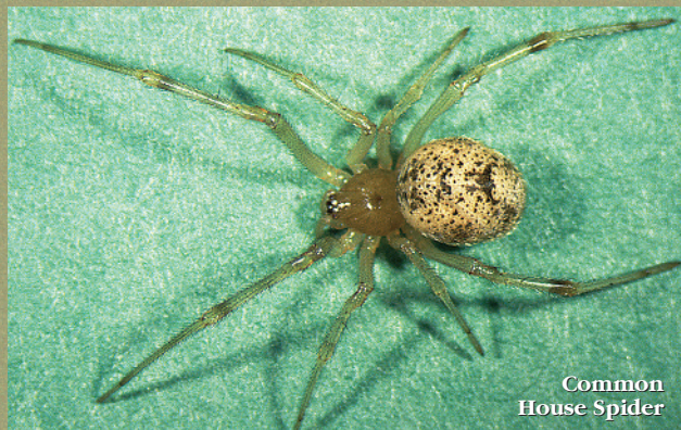
Common House Spider

Web-building spiders, such as the common house spider, will eat their old web, converting the protein into new silk in as little as 30 minutes.