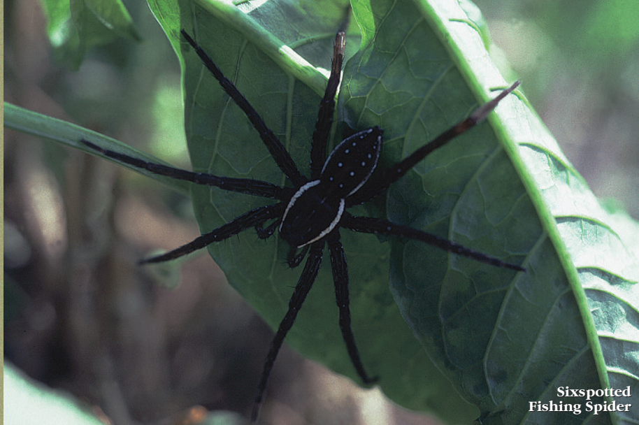
Sixspotted Fishing Spider

constructing intricate webs to ensnare their victims, spiders are consummate predators. They are able to overcome a wide variety of insects, arachnids and even some vertebrates with the use of silk and their venomous bites. Although the diet of the black and yellow garden spider, Argiope aurantia , consists mainly of insects, one individual captured and consumed a skink. Members of the hunting spider genus Dolomedes are commonly called “fishing spiders” because several species regularly eat small minnows and tadpoles. Before closely approaching an ensnared, potentially dangerous prey item, web builders, such as the common house spider, Achaearanea tepidariorum , will securely wrap its intended victim with silk, then deliver one or more bites once the prey is rendered immobile. Many years ago, I observed a large black and yellow garden spider which