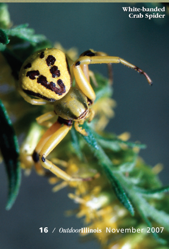
White-banded Crab Spider

Spiders use a variety of techniques to avoid predators, including coloration, patterning, mimicking ants, and, in the case of jumping spiders, jumping 20 times its own body length.