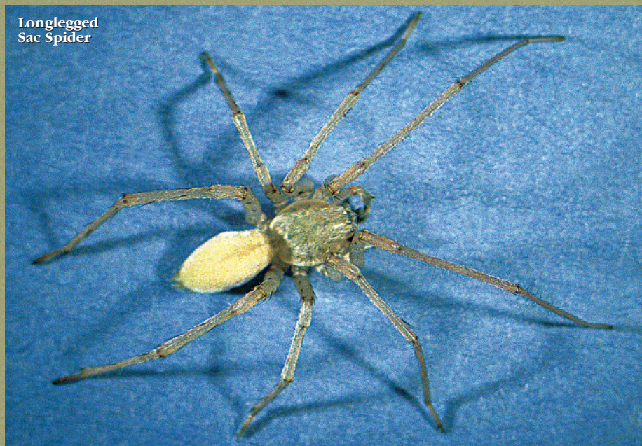
Longlegged Sac Spider

Although they are predators, spiders are opportunists. Some wolf spiders and jumping spiders will readily scavenge dead insects when they encounter them. One researcher recently discovered that the brown recluse spider, Loxosceles reclusa , actually prefers dry,