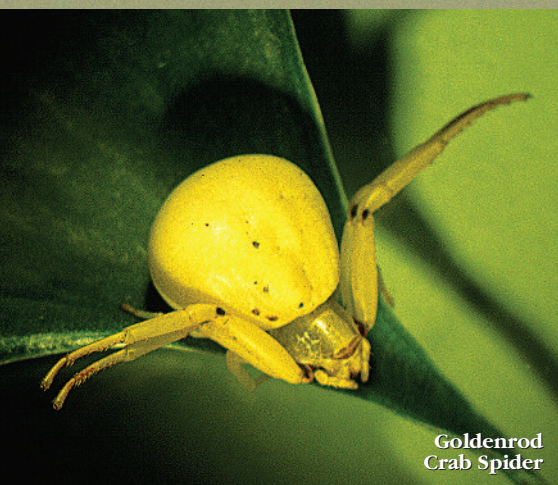
Goldenrod Crab Spider

Characteristics all spiders share include having eight jointed legs, an exoskeleton and spinnerets at the end of their abdomen.