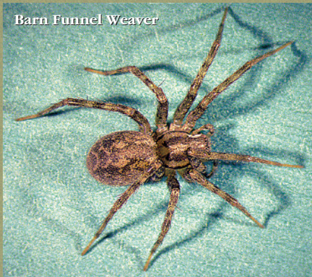
Barn Funnel Weaver

Some spiders, including many orb-weavers such as the yellow and black garden spider, spend the winter inside egg sacs. Although they may be protected from the cold due to physiological changes that enable them to withstand freezing temperatures, the spiderlings in these egg sacs often fall victim to birds which discover a ready winter meal. In some areas, more than 98 percent of the egg sacs are torn open during the winter by birds.