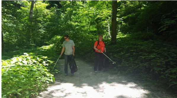
Starved Rock Clean Up Crew

Volunteers can also apply to be on our board, or work on a committee/team in trail clean up and improvement, archives, educational programs (guided hikes, special events, and school/scout groups), help in the office, or with fundraising.