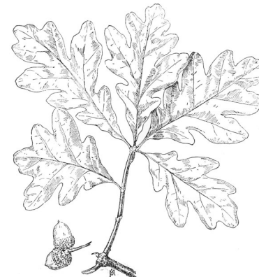
White Oak Quercus alba

Most of southern Illinois's forests were completely cleared in the early 1800s. Sometimes small tracts of trees were left standing because the ground was too rugged to farm. The large white oak trees in this forest are at least a hundred years old and were probably good sized when pioneers moved into this valley. White oak is the State Tree of Illinois, and the wood is prized for furniture, barrels, and paneling. Note the whitish appearance of its bark.