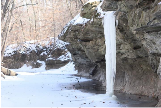
Sweet Gum Trail