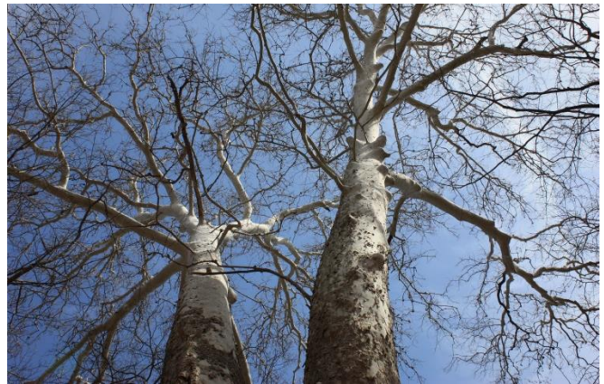
White Oak Loop