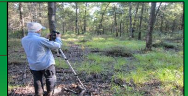
Photo stations are being established to visually track the habitat changes over time.

As part of a statewide species recovery effort, a second barn owl nest box will be erected at the site. This box will be monitored as part of the statewide effort.